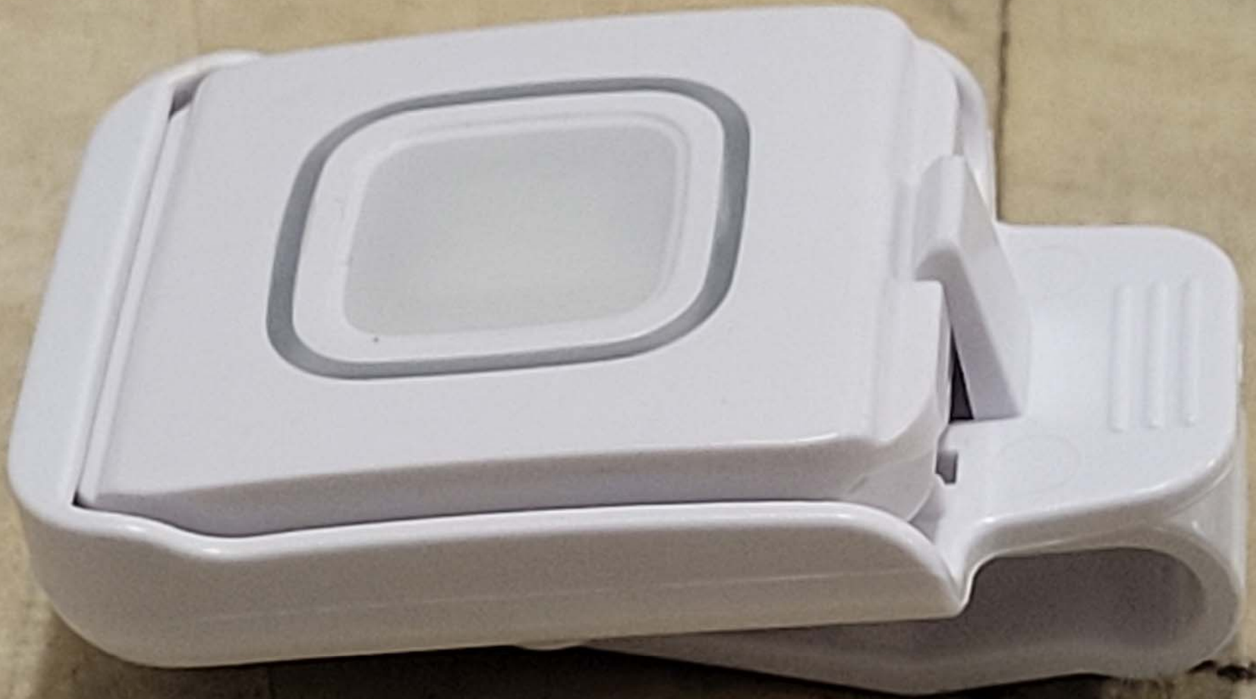
Side View #2 of the EUT