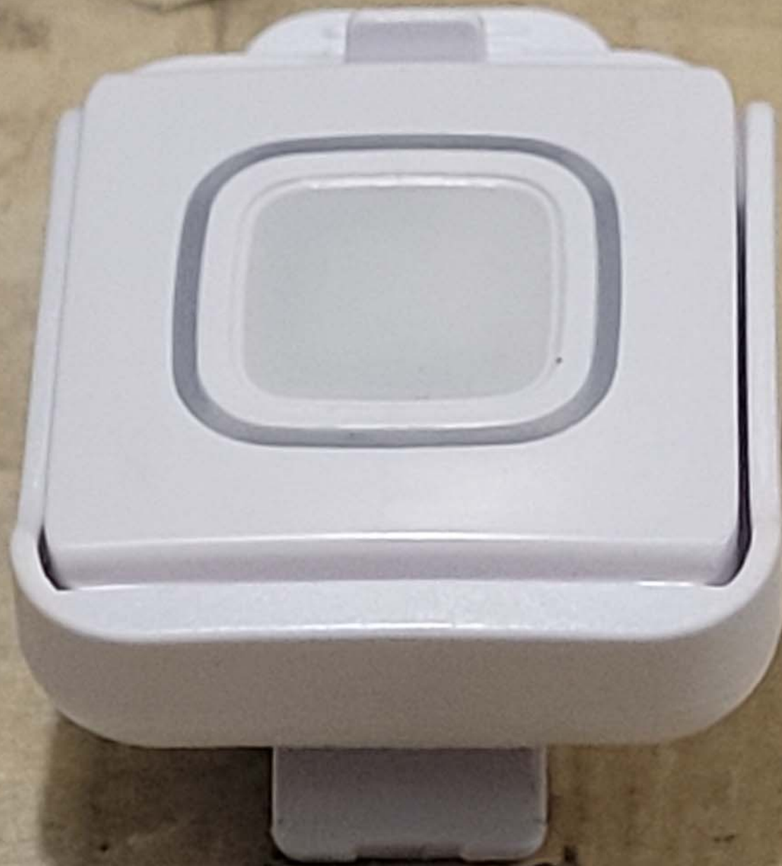
Side View #3 of the EUT