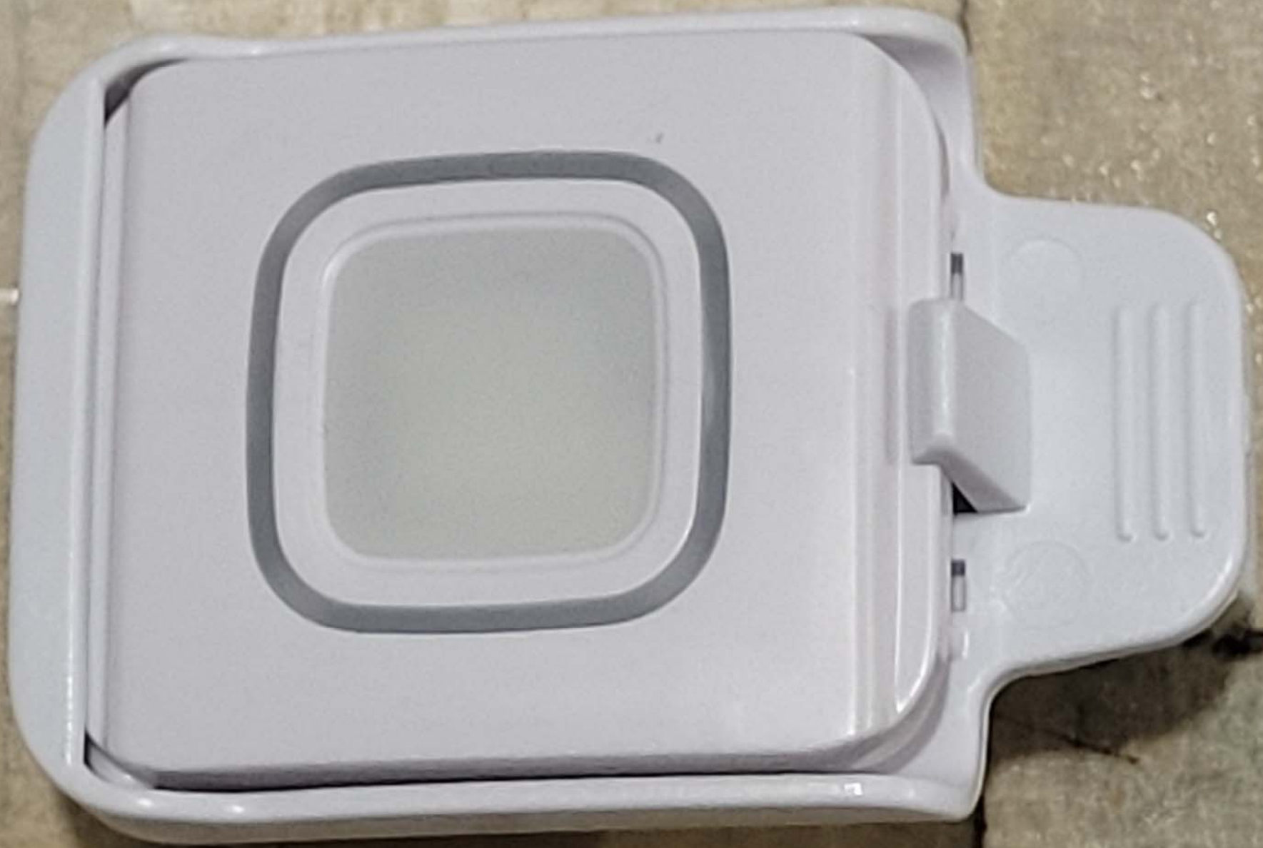
Top Side of the EUT