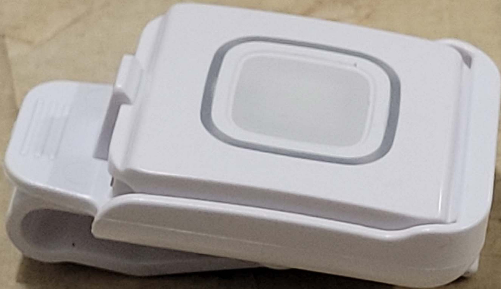
Side View #4 of the EUT