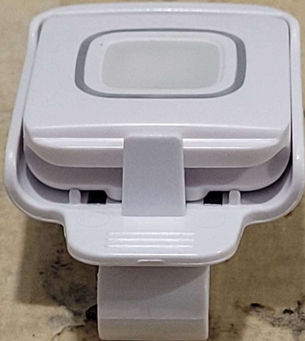
Side View #1 of the EUT