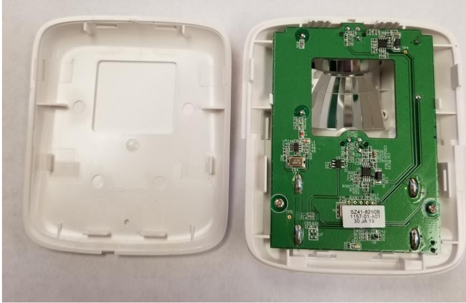
Back of Front lens cover