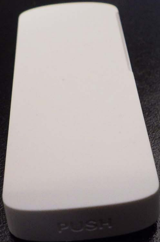
Side View of the EUT #2