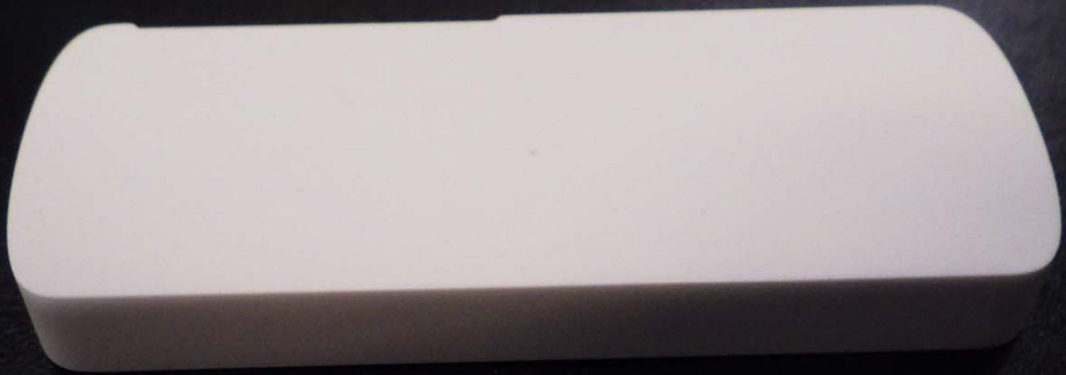
Side View of the EUT #1