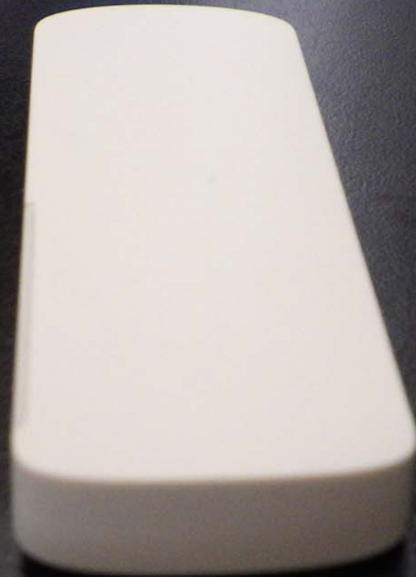
Side View of the EUT #4