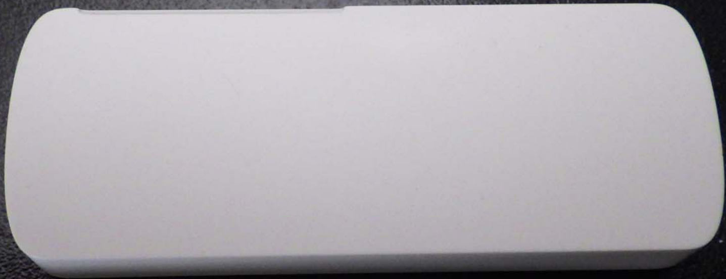
Top View of the EUT