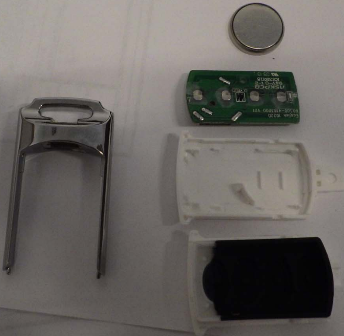
Inside View #2