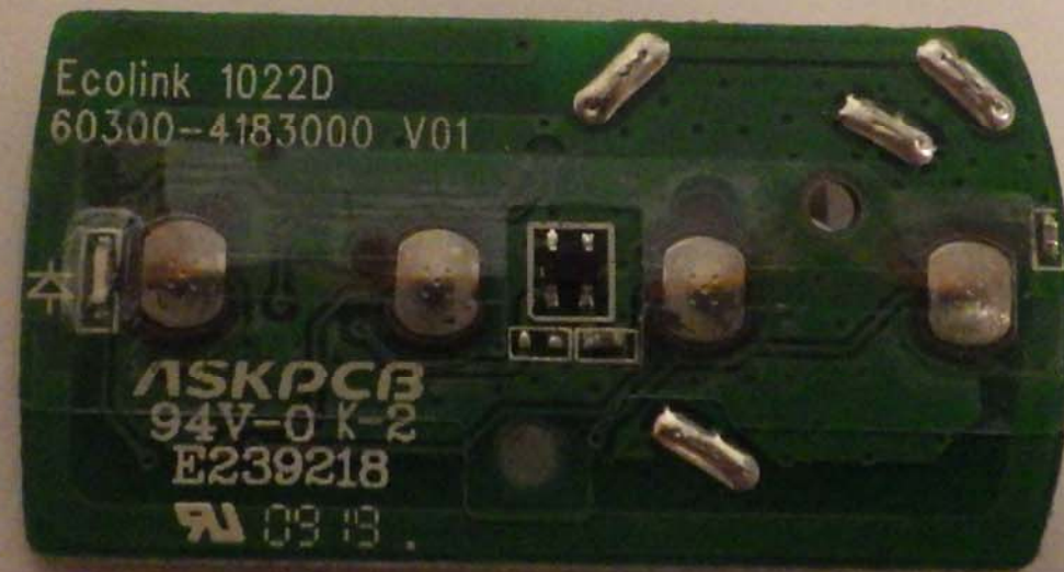
Bottom View of the PCB - View #2