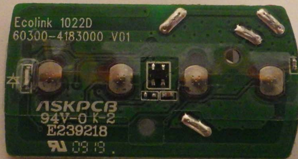
Bottom View of the PCB - View #1