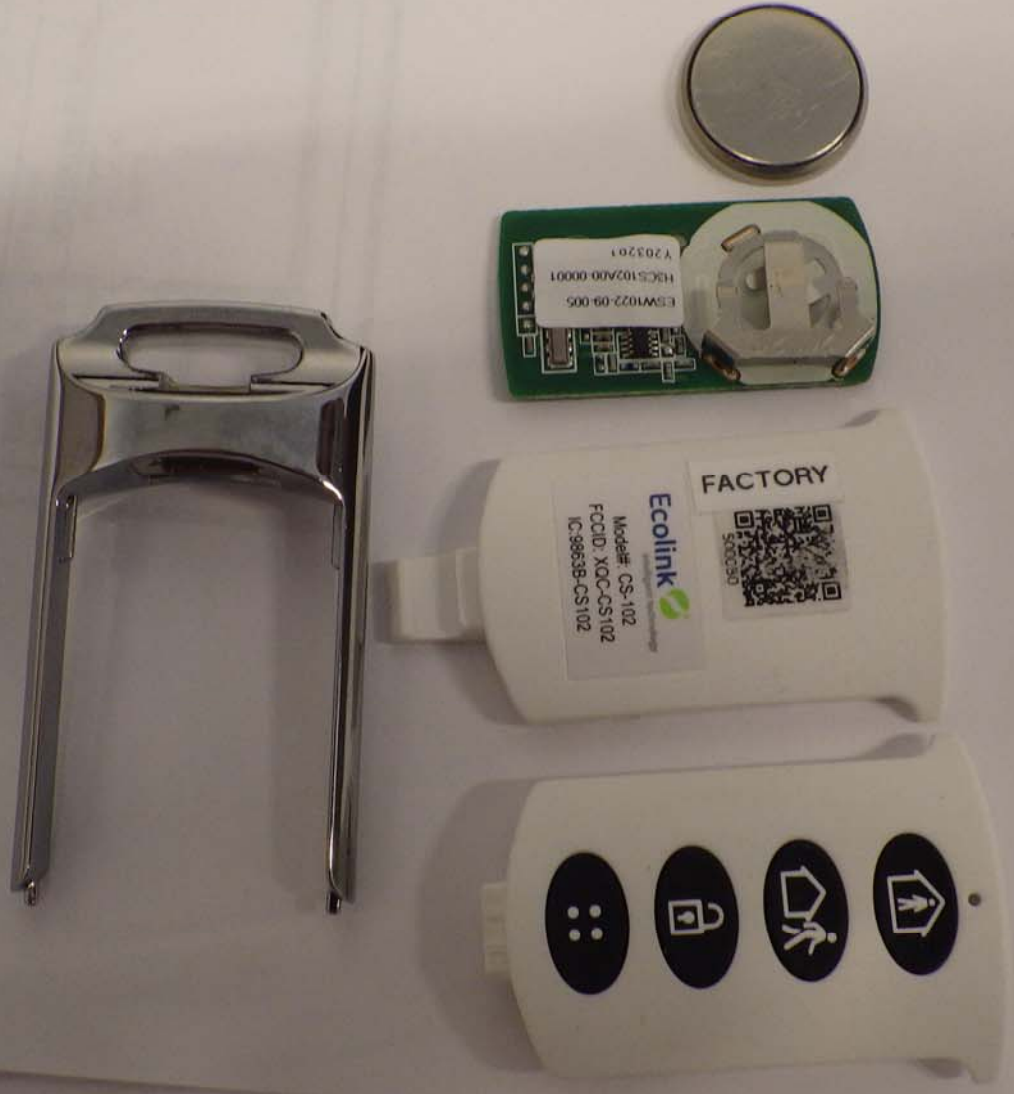
Inside View #3