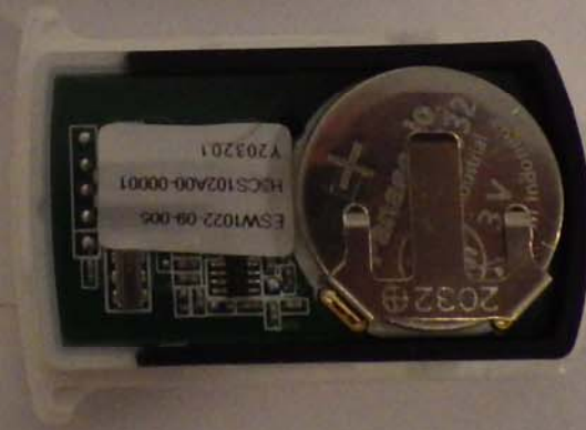
Inside View #1