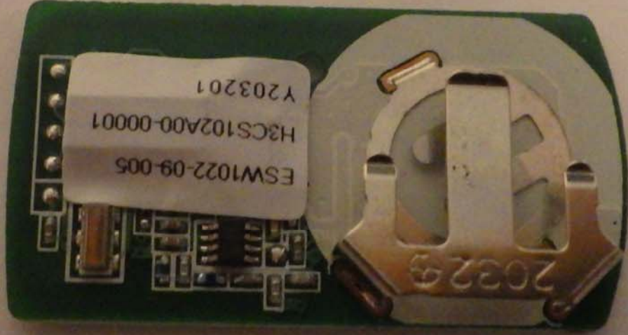
Top View of the PCB with Sticker