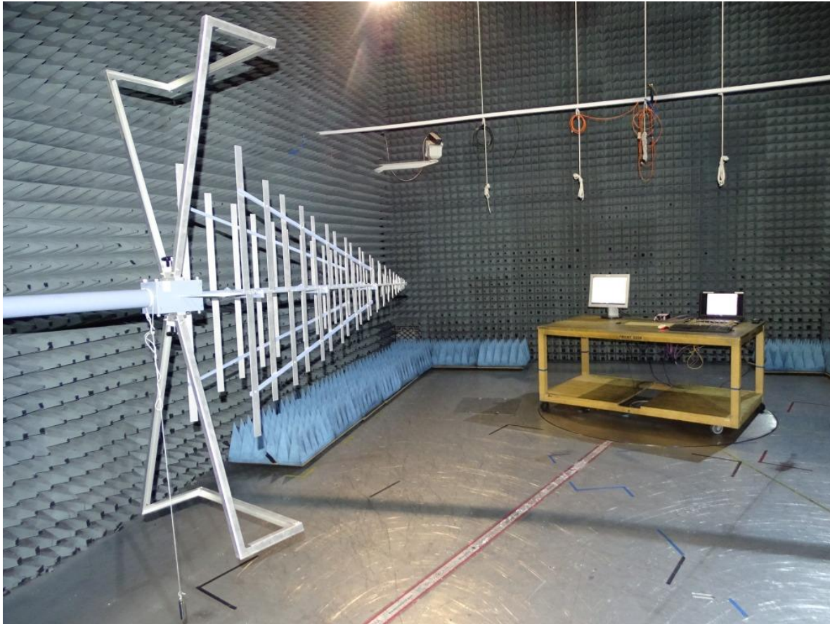
Photo 3: Test setup for radiated measurements (FCC 15B - below 1 GHz)