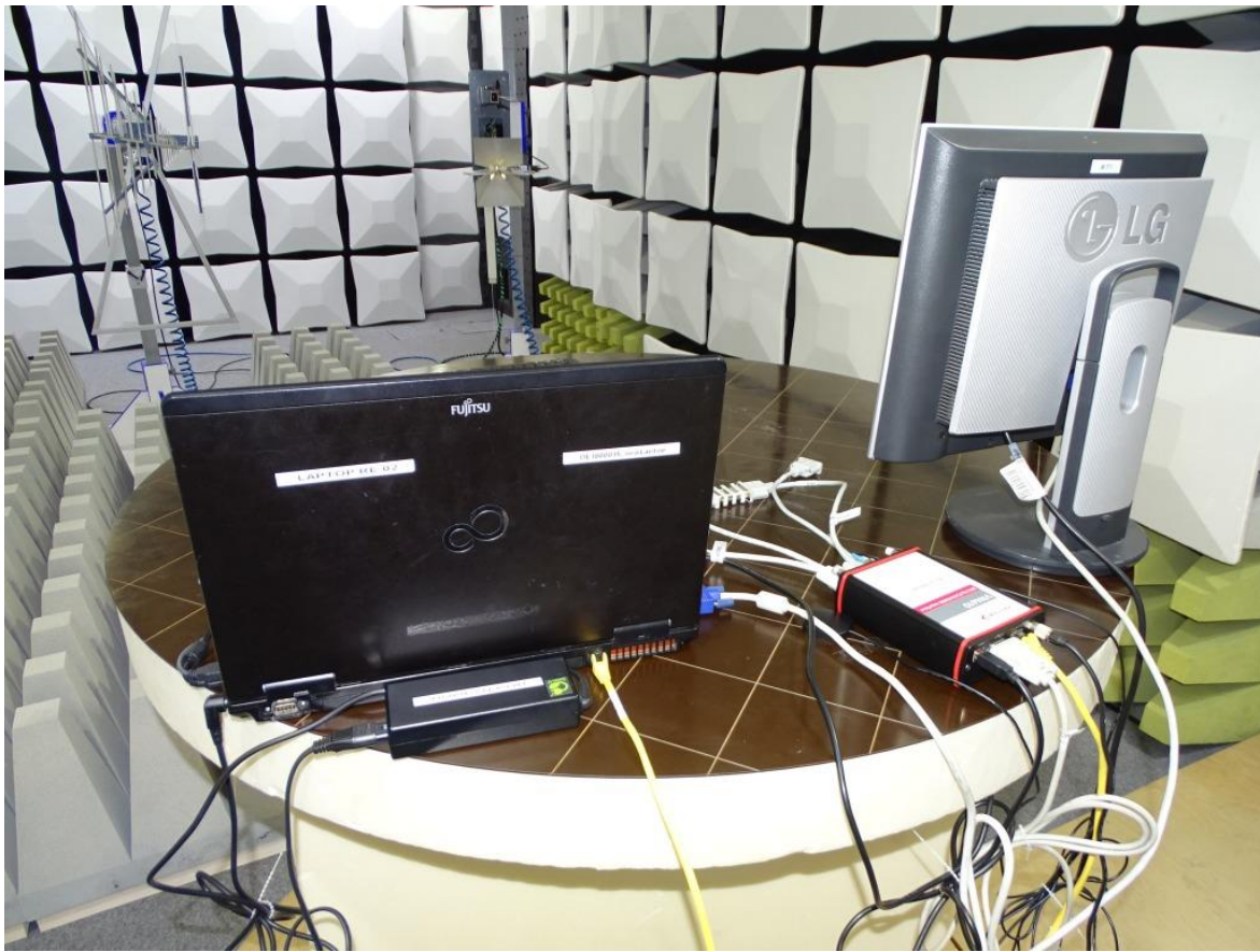
Photo 4: Test setup for radiated measurements (FCC 15B - above 1 GHz)