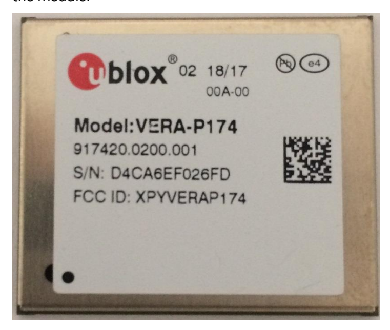
Figure 2: VERA-P1 label location

The label is centered on the shield box, with the pin 1 marker (black dot) corresponding to pin 1 of the module.