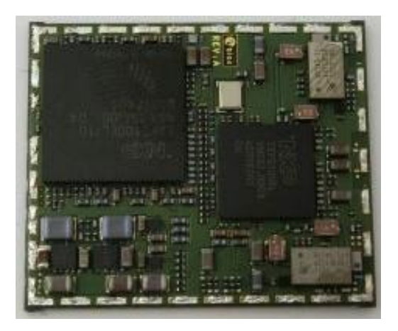
Figure 2: VERA-P173-00A internal photo