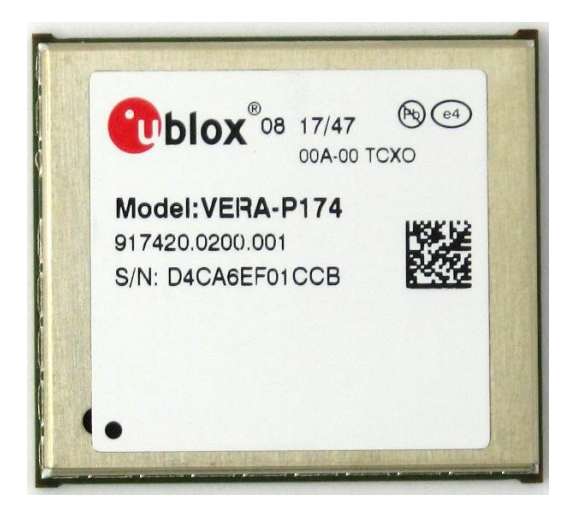
Figure 3: VERA-P174-00A top view external photo (FCC ID not printed on the label)