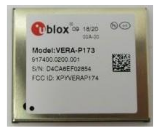
Figure 4: VERA-P173-00A top view external photo