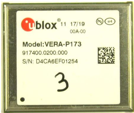
Figure 2: VERA-P173 label location (certification IDs not printed on module prototypes, this is just to demonstrate the label location)

The label should be centered on the shield box, with the pin 1 marker (black dot) facing pin 1 of the module.