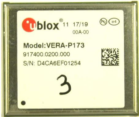
Figure 2: VERA-P173 top view external photo (FCC ID not shown on the label due to prototype product status, ignore the "3" on the label)