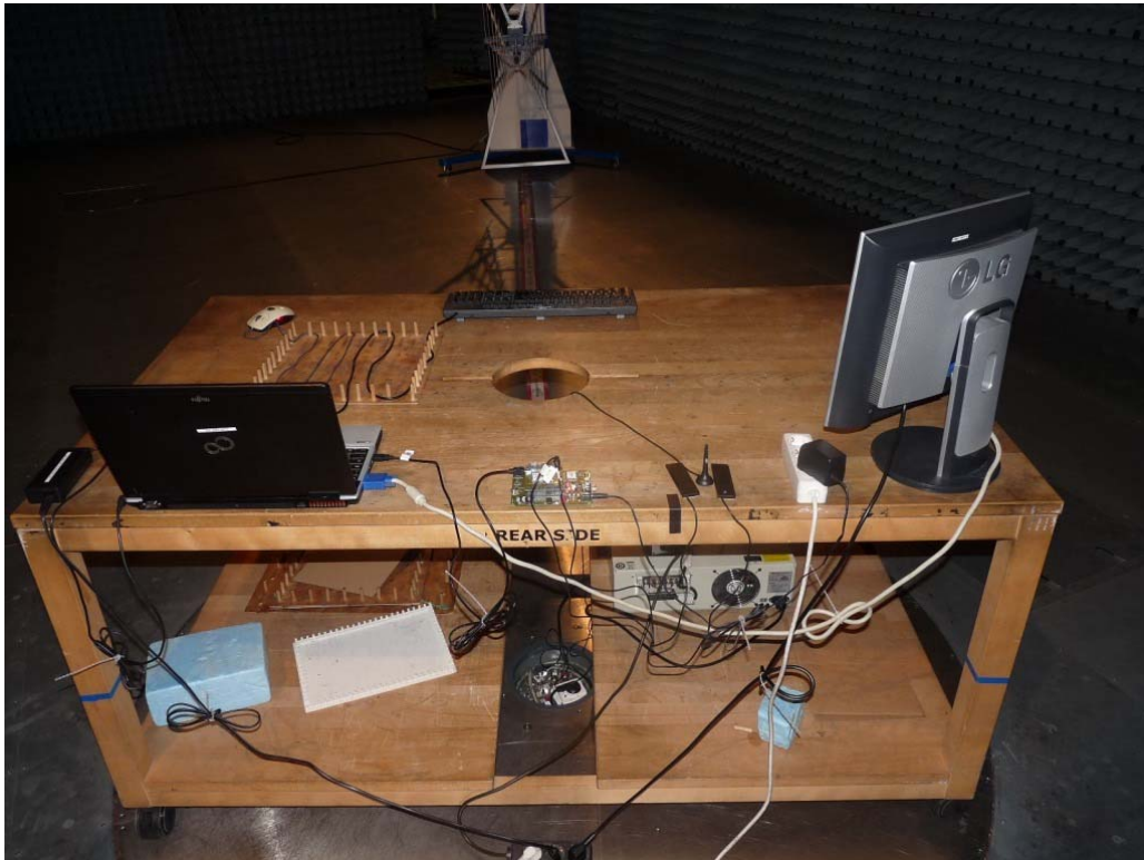
Photo 4: Test setup for radiated measurements (computer peripheral setup, EUT supplied by AC adapter, unintentional radiator §15)