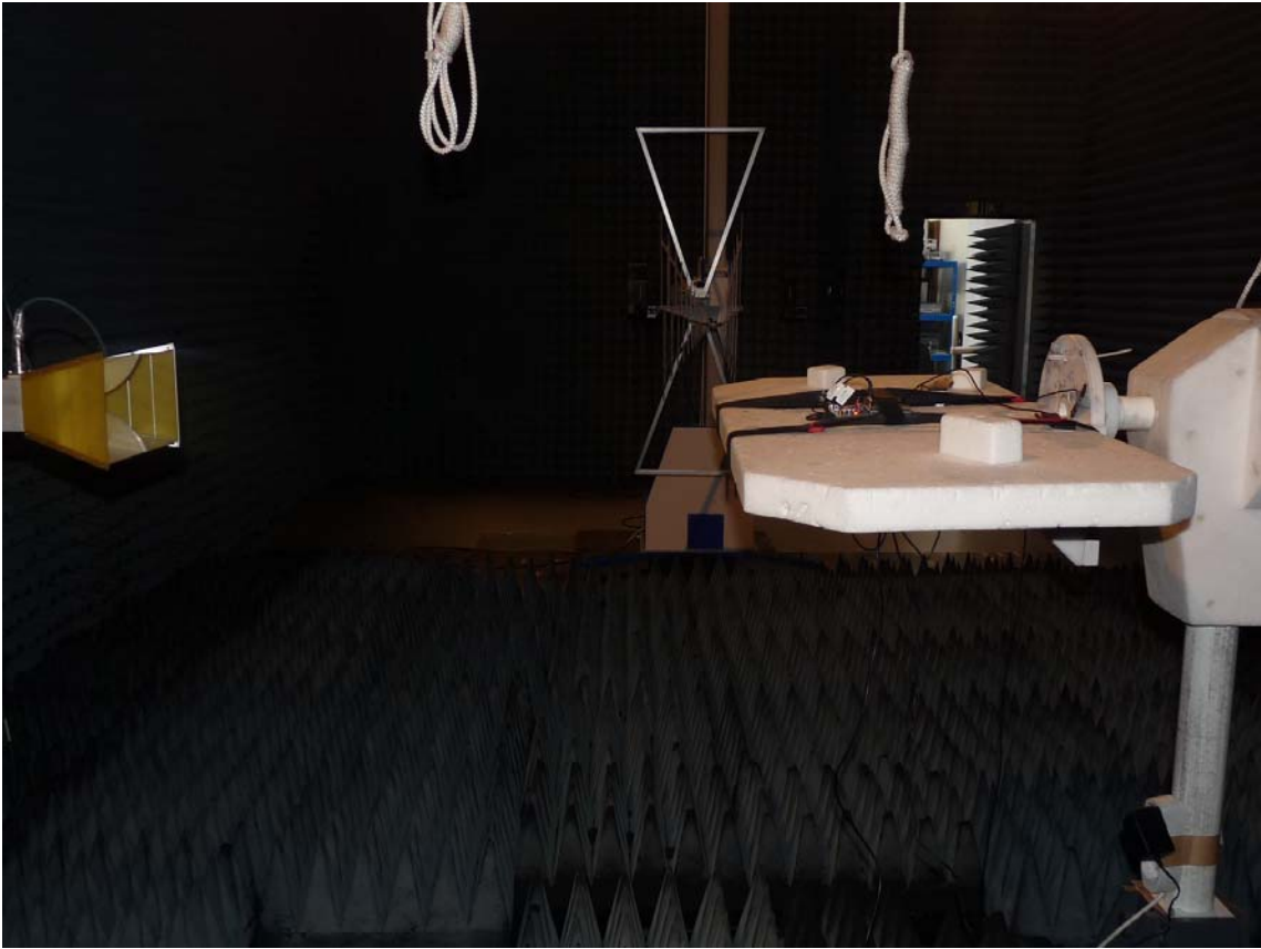
Photo 1: Test setup for radiated measurements (Enclosure, fully-anechoic chamber, 1-18 GHz intentional radiator §15 / 30 MHz – 10/20 GHz §22/24/27)