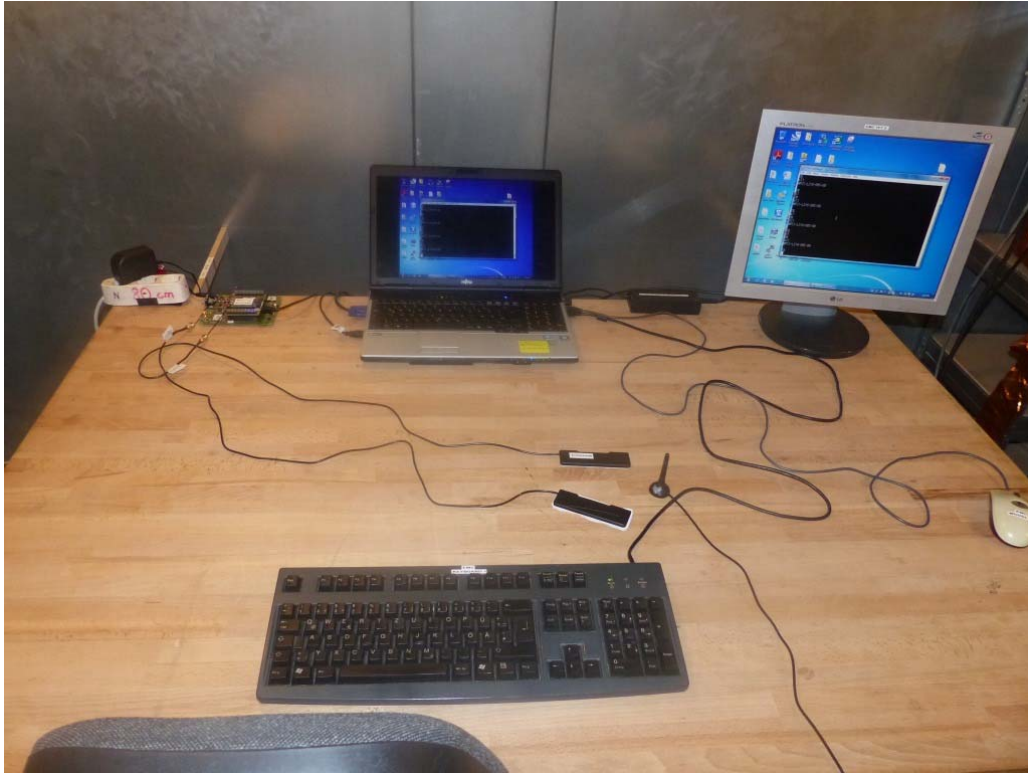
Photo 2: Test setup for conducted measurements (computer peripheral setup, EUT supplied by AC Adapter, unintentional radiator $15)