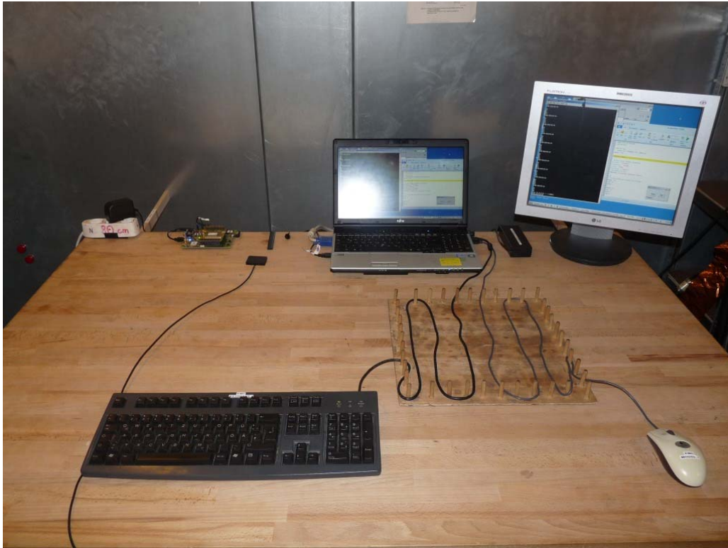
Photo 1: Test setup for conducted measurements (computer peripheral setup, EUT supplied by ACDC Adapter, unintentional radiator $15)