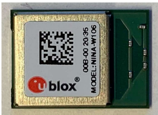
Figure 1: Label location of the NINA-W106, NINA-W136, NINA-W156, NINA-B226 modules