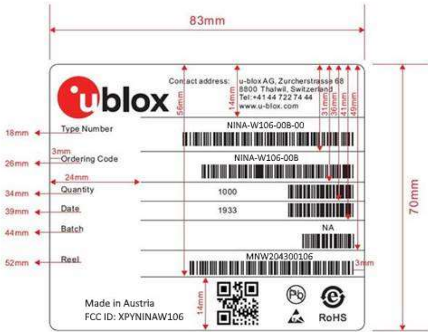
Figure 4: NINA-W106, NINA-W136, NINA-W156, NINA-B226 batch label