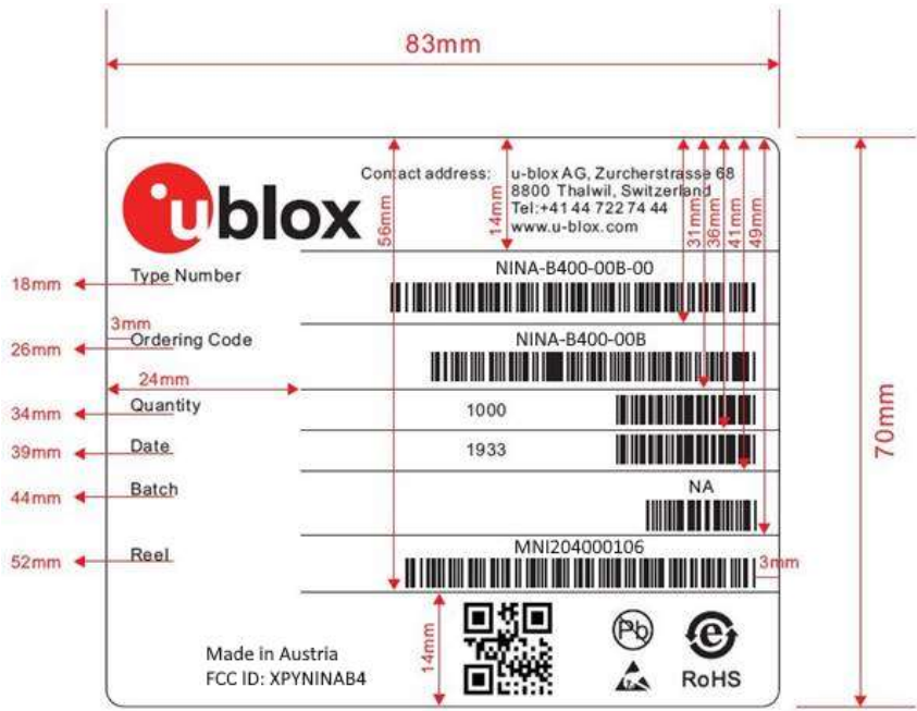
Figure 4: NINA-B4 series batch label