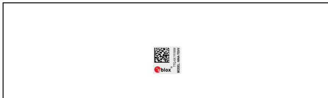
Figure 2: Actual size of the NINA-B401 and NINA-B411 identifier marking (7.5 x 7.5 mm)

The modules are SMT components shipped to the OEM-integrator on Tape&Reel packed in a sealed Dry-Pac bag and mounted onto the host board by automatic “Pick&Place” machines. As the module is a surface mount device that is soldered onto the host it is not possible to place the label on the secondary side of the module.