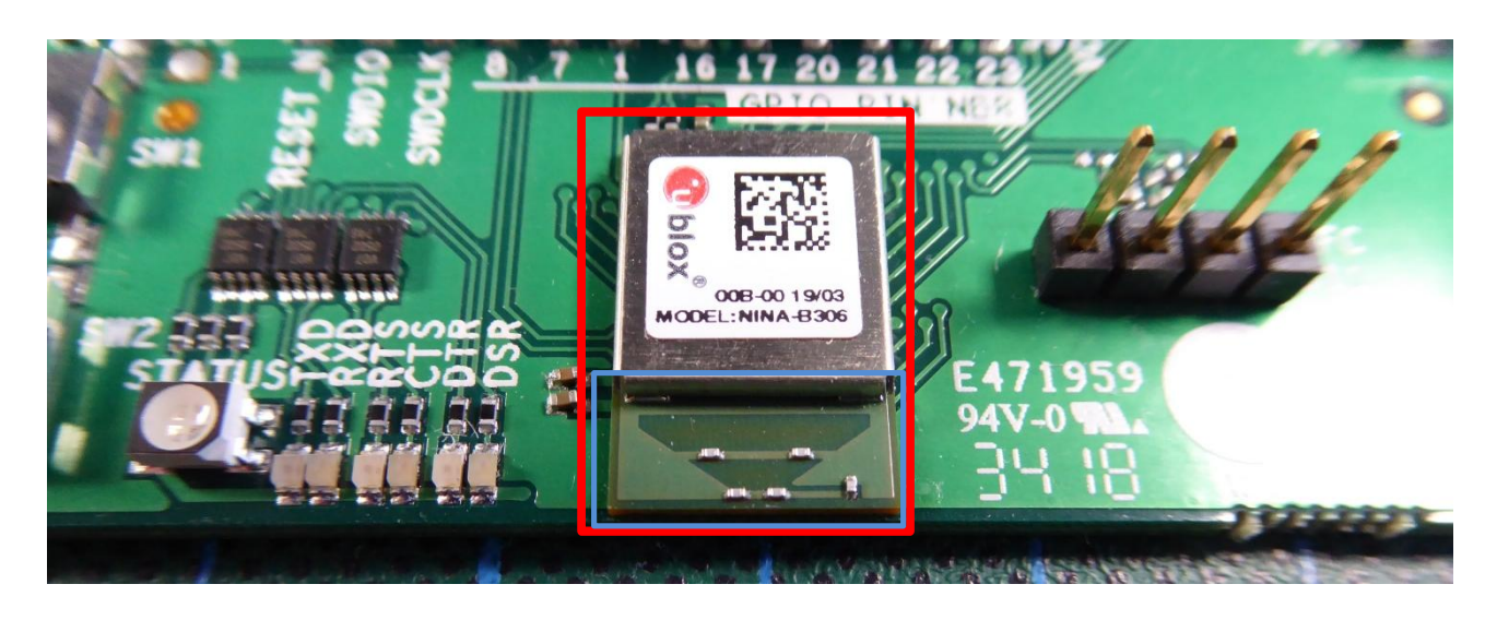
NINA-B3x6 with internal antenna on not marketed eval board – detail view

Examiner: Bernward ROHDE Report Number: F190149E3 Date of issue: 13.03.2019 Order Number: 19-110149 page 3 of 4