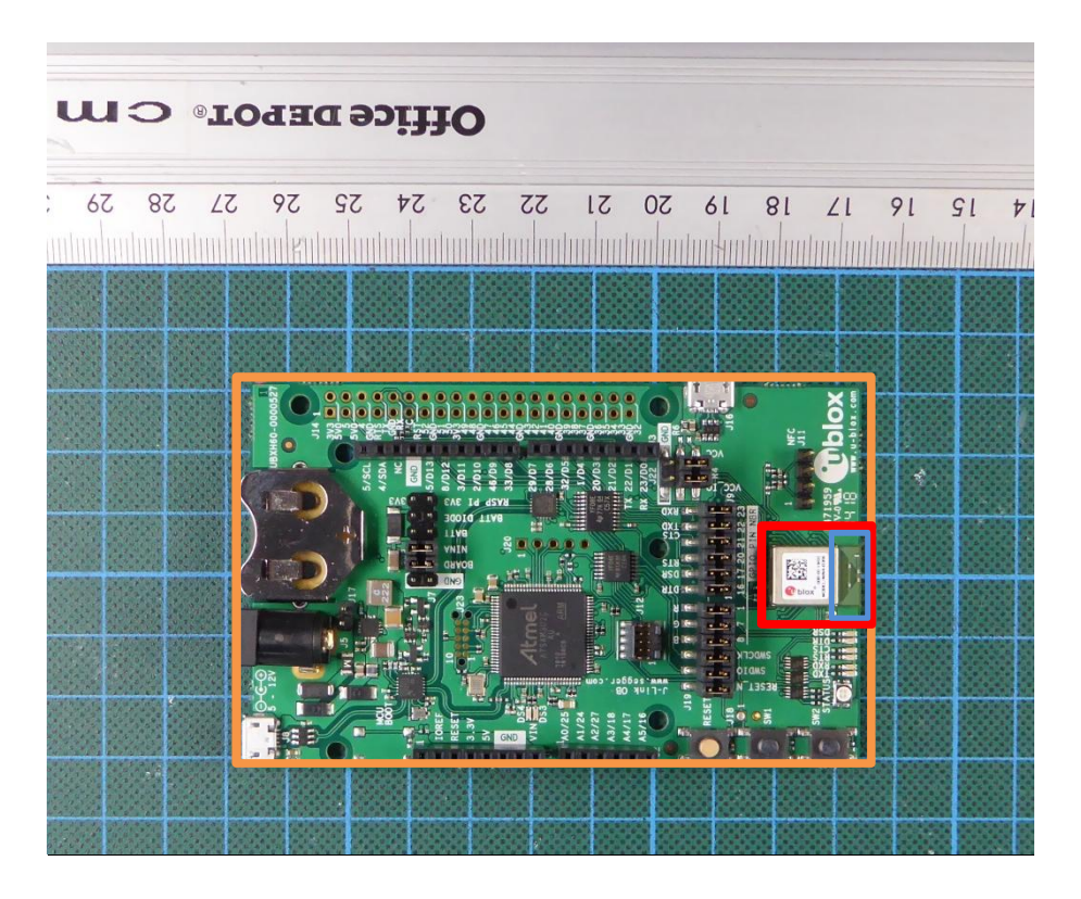
NINA-B3x6 with internal antenna on not marketed eval board – top view

Examiner: Bernward ROHDE Report Number: F190149E3 Date of issue: 13.03.2019 Order Number: 19-110149 page 1 of 4