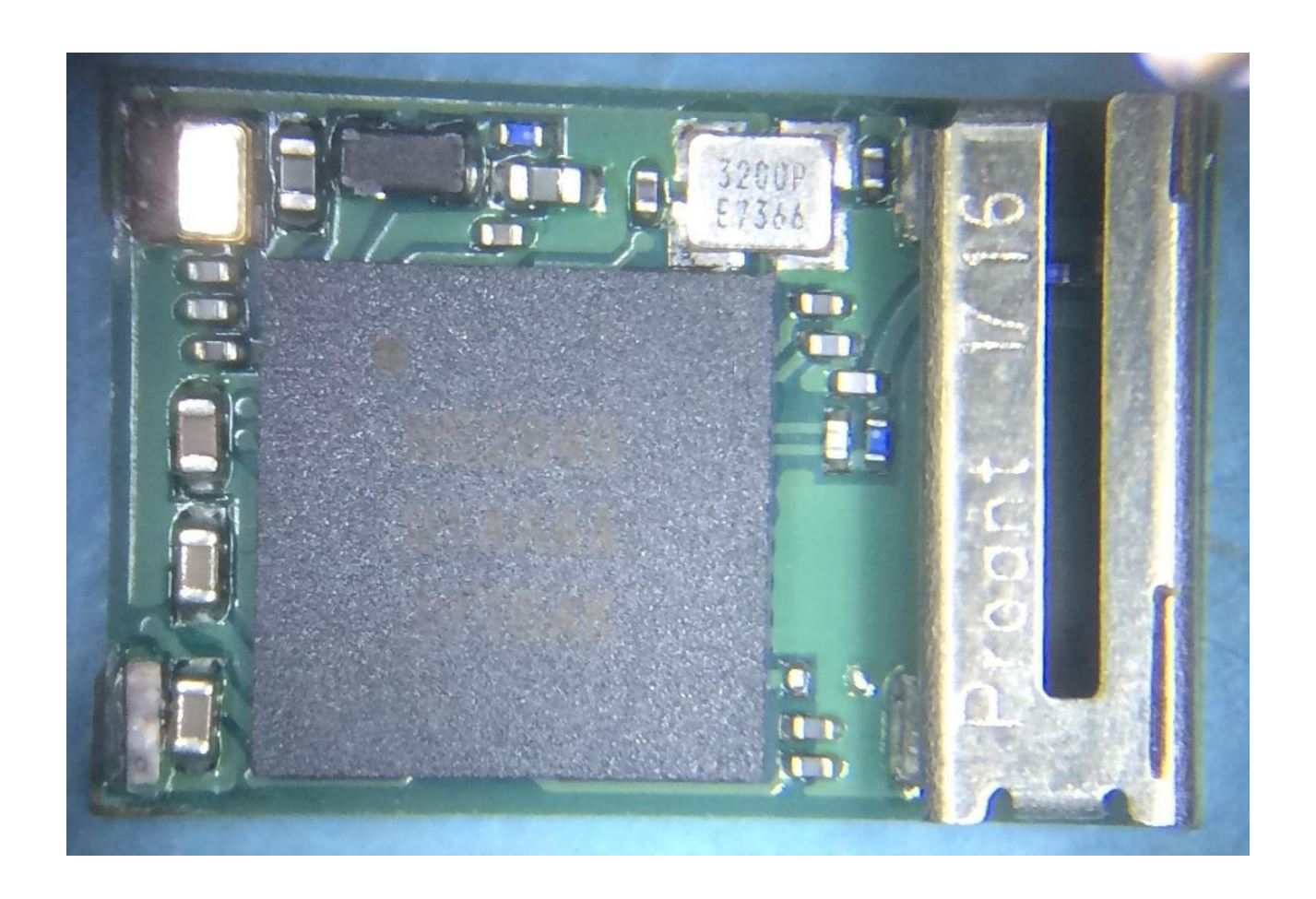
NINA-B3x1_internal_photo*1: EUT NINA-B3 series with integral u-blox LILY Antenna – without shielding