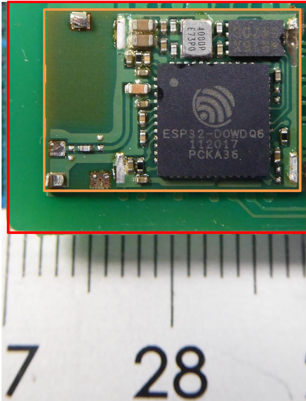
170297_E8_21.jpg: EUT (with onboard antenna removed) without shielding on not marketed eval board