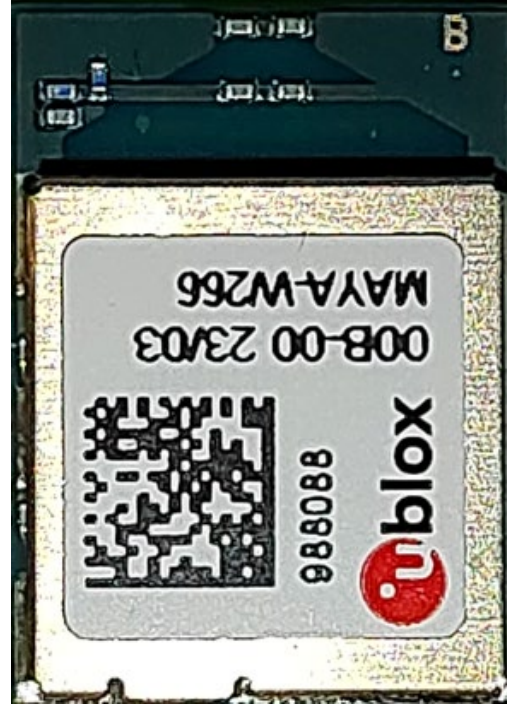
Figure 2: MAYA-W266-00B external photo