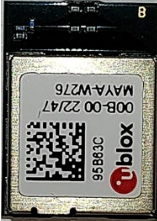
Figure 1: MAYA-W276-00B external photo