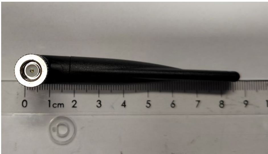
Figure 4: Antenna length _ photo to show the antenna connector.