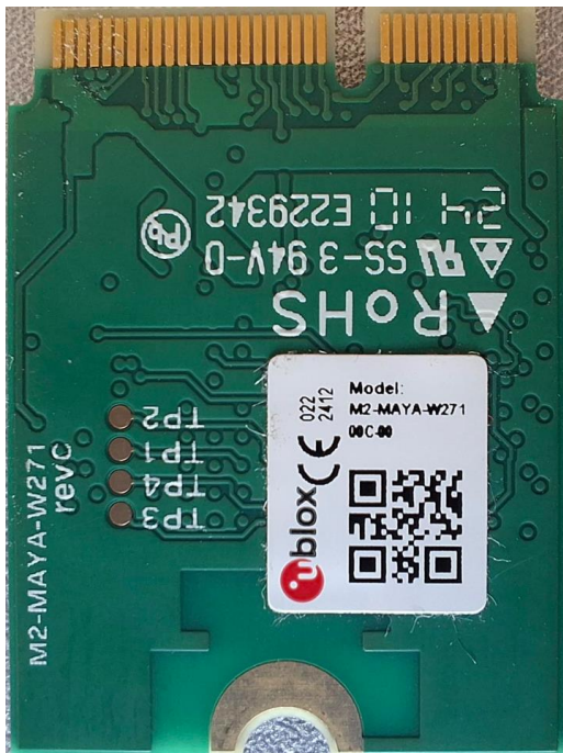
Figure 2: M2-MAYA-W271 bottom view