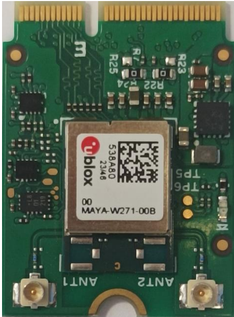
Figure 2: M2-MAYA-W271 top view external photo