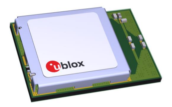
Figure 3: Label location of the MAYA-W2 modules

The modules are SMT components shipped to the OEM-integrator on Tape&Reel packed in a sealed Dry-Pac bag and mounted onto the host board by automatic "Pick&Place" machines. As the module is a surface mount device that is soldered onto the host it is not possible to place the label on the secondary side of the module.