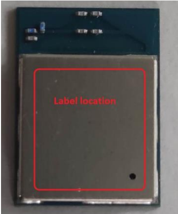
Figure 3: Label location of the MAYA-W1 modules

The modules are SMT components shipped to the OEM-integrator on Tape&Reel packed in a sealed Dry-Pac bag and mounted onto the host board by automatic “Pick&Place” machines. As the module is a surface mount device that is soldered onto the host it is not possible to place the label on the secondary side of the module.