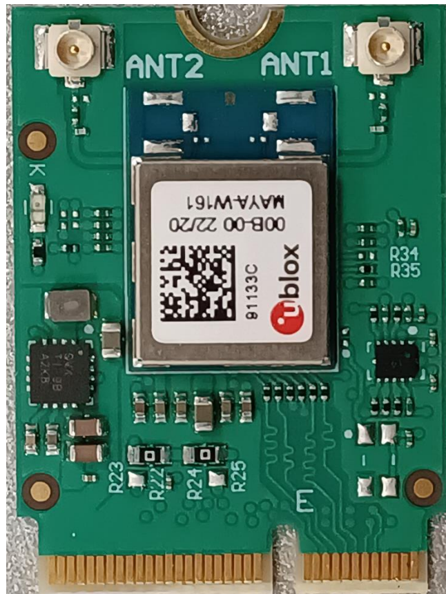
Figure 2: M2-MAYA-W161 top view external photo