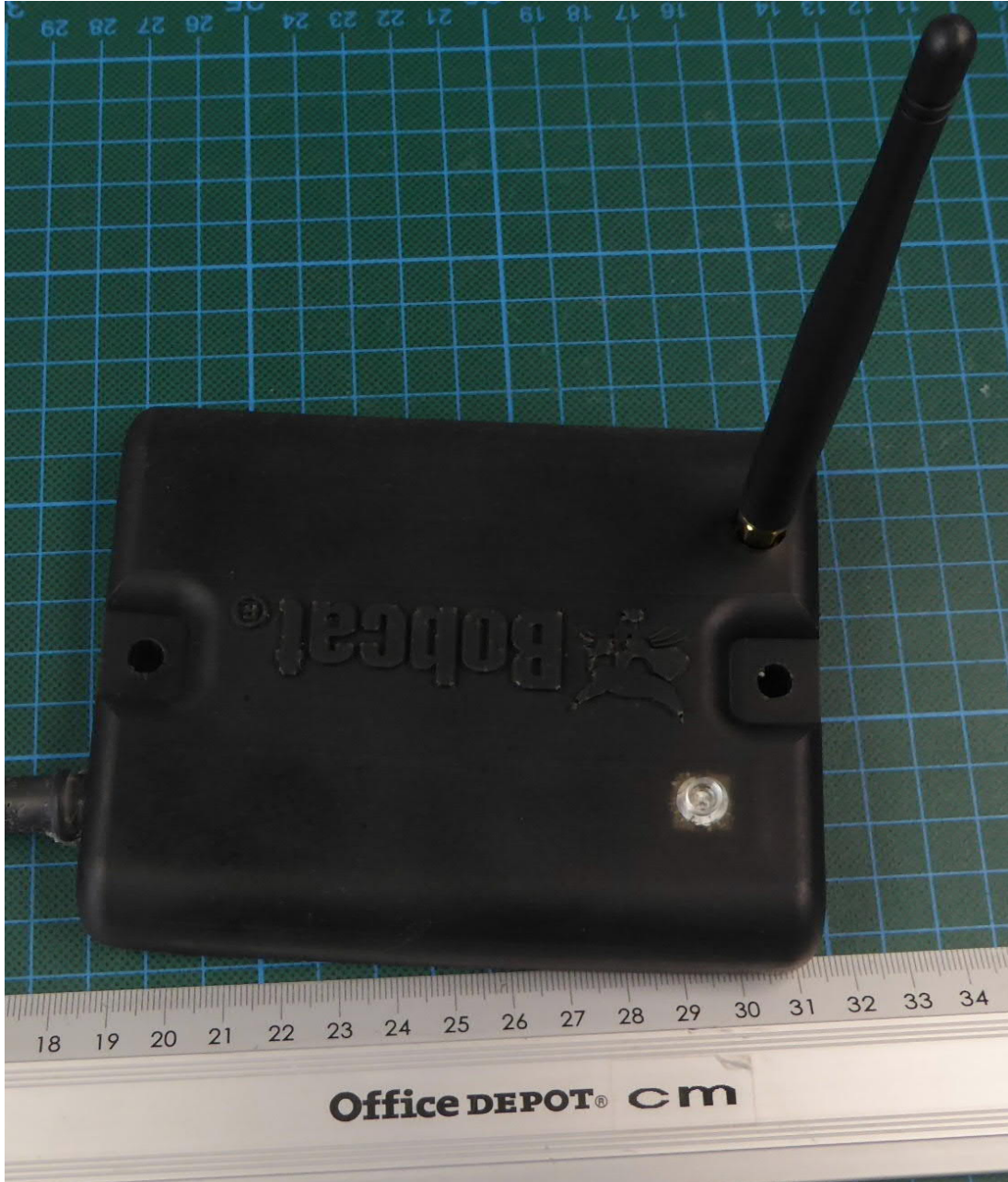
EUT – top view with antenna attached