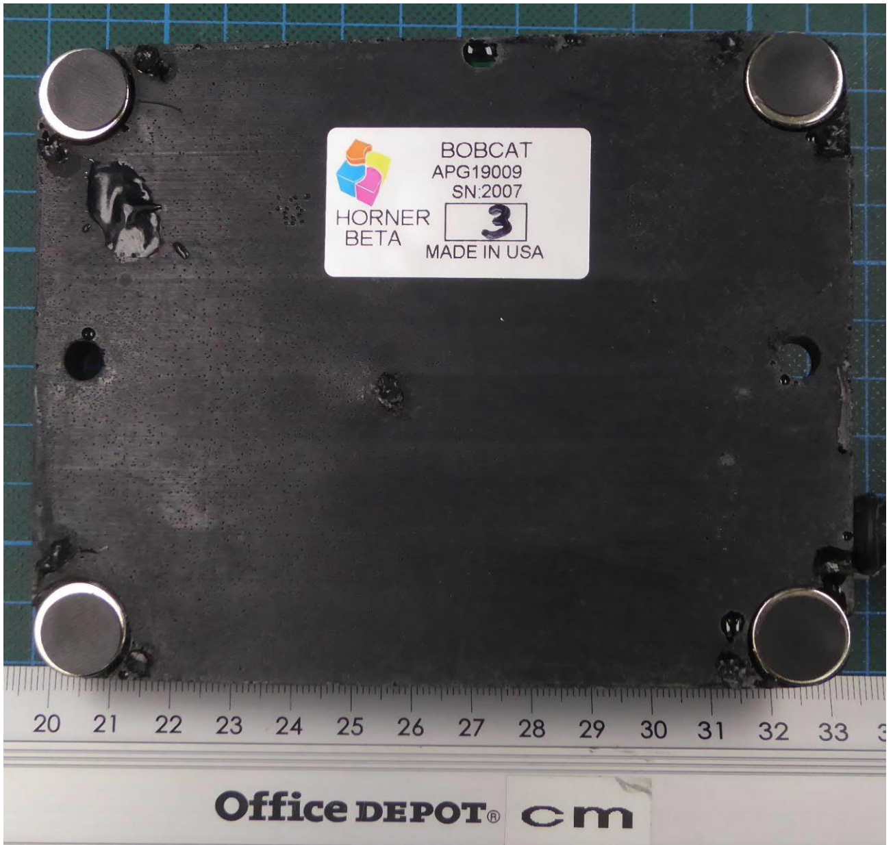
EUT – bottom view