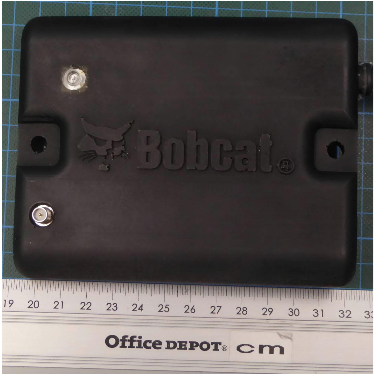
EUT – top view without antenna