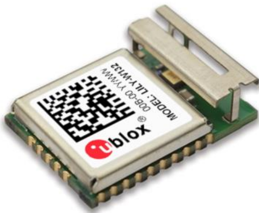
Figure-1 LILY-W132 with identifier label.

The module outline size is 14.0 x 10.0 mm and the size of the identifier label located on the shield box is only 7.5 x 7.5 mm. The model name (HVIN) is printed on the identifier label. The size of the module/label makes it not possible to print the FCC and IC IDs on the identifier label. Instead are the FCC and IC IDs printed on the cardboard box and on the sealed dry bag.