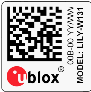
Figure-3 LILY-W131 label.