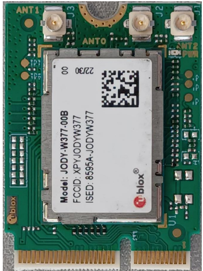
Figure 2: M2-JODY-W377-00B top view external photo