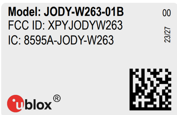
Figure 5: JODY-W263-01B label