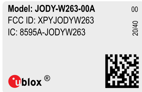
Figure 3: JODY-W263-00A label