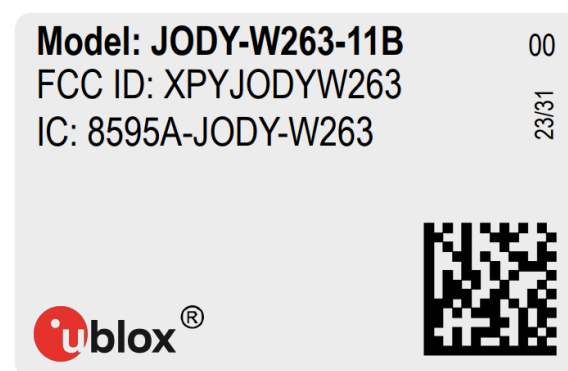
Figure 6: JODY-W263-11B label