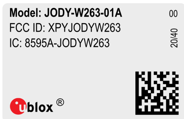
Figure 2: JODY-W263-01A label