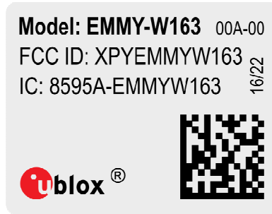
Figure 3: EMMY-W163 label