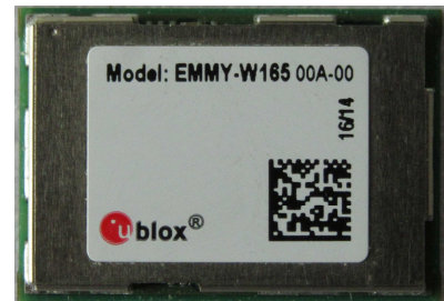
Figure 7: EMMY-W165 label location