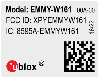
Figure 2: EMMY-W161 label