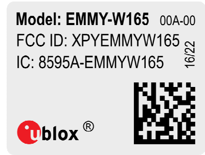
Figure 4: EMMY-W165 label