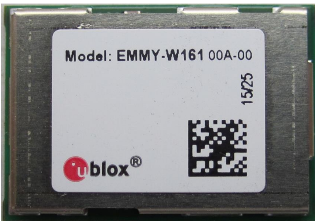
Figure 4: EMMY-W161 label location

The label is placed on top of the shield of the EMMY-W1 series modules as shown in and (certification IDs not printed on module prototypes, this is just to demonstrate the label location).