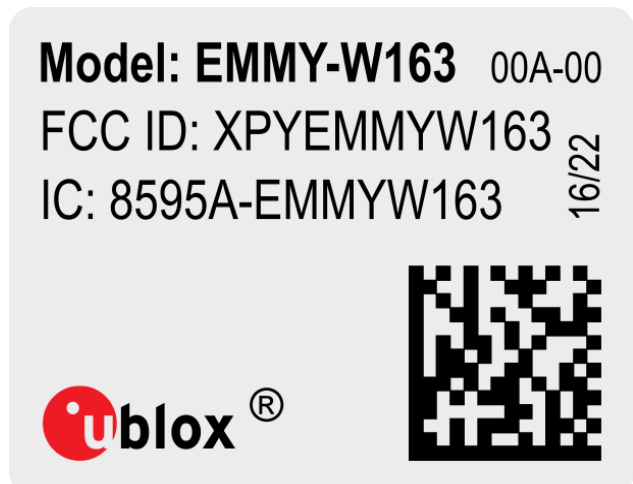
Figure 3: EMMY-W163 label