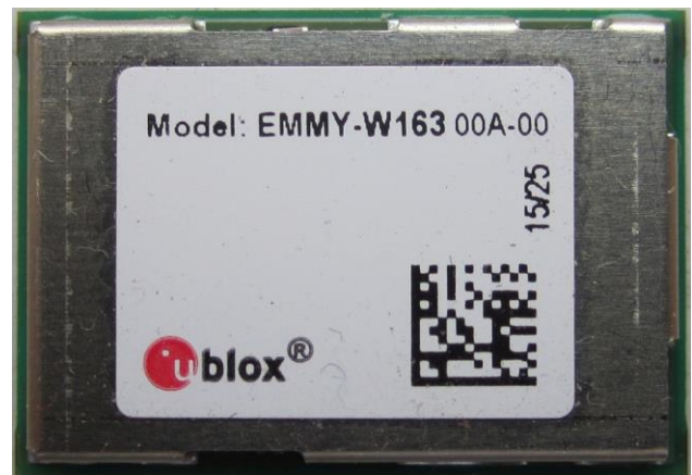
Figure 5: EMMY-W163 label location