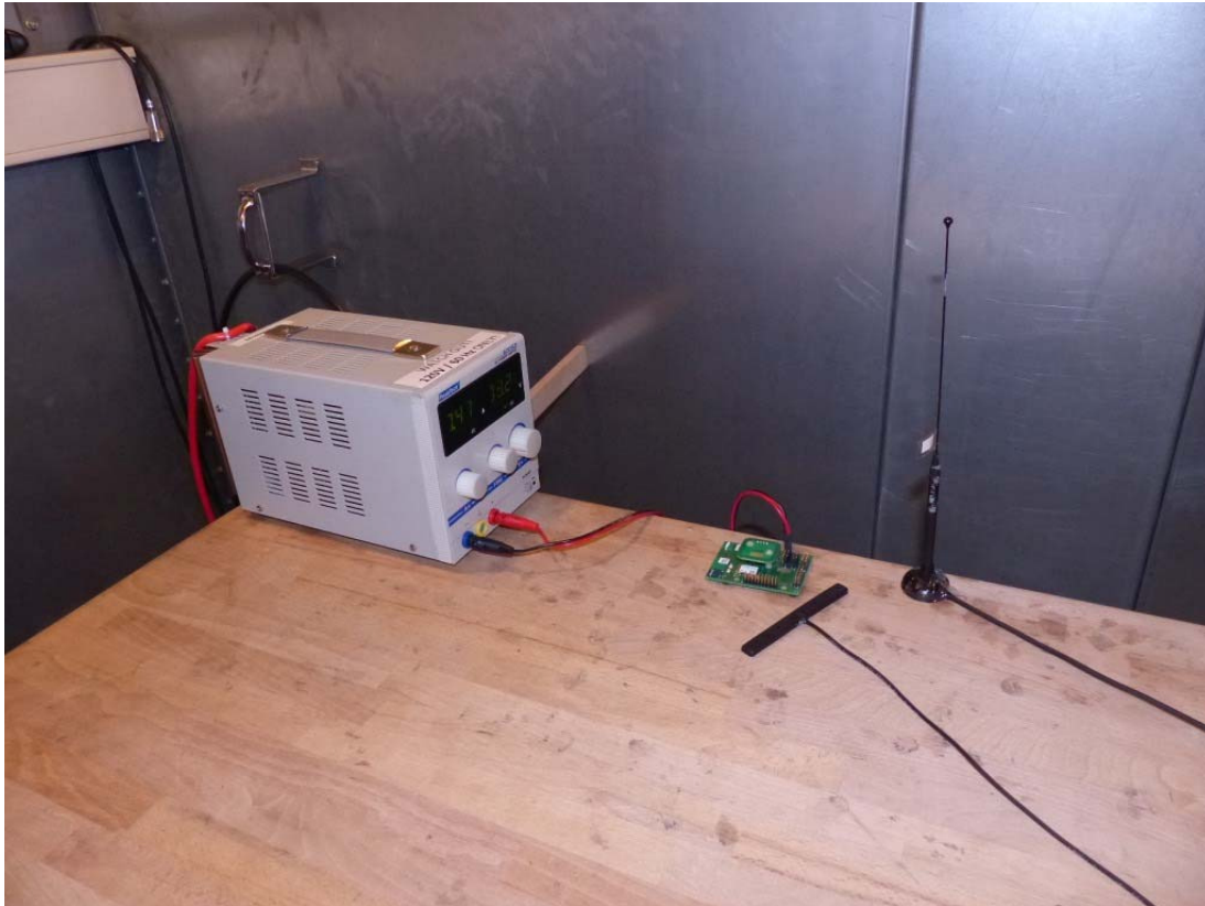
Photo 1: Test setup for conducted measurements at AC Port of lab power supply