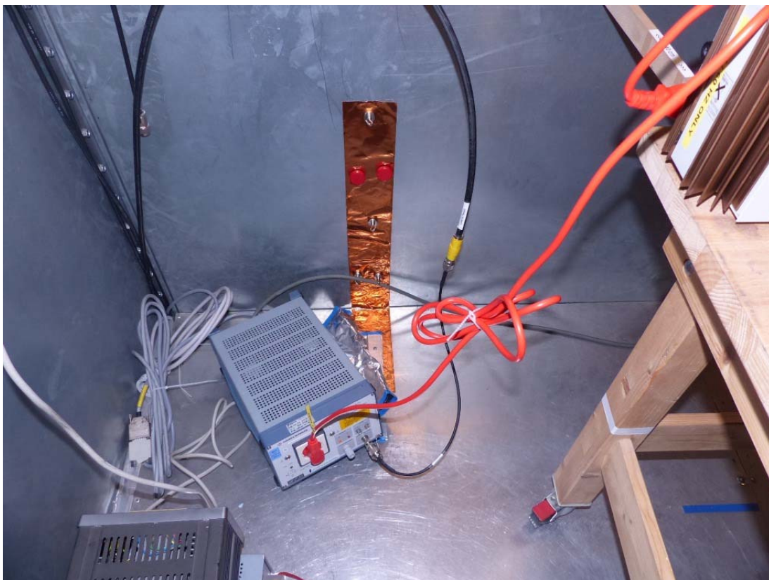
Photo 2: Test setup for conducted measurements (AC power line connected to LISN)