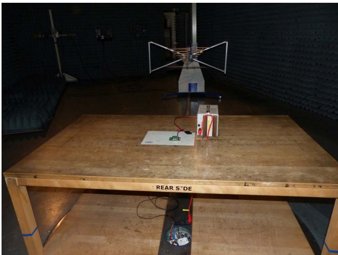
Photo 4: Test setup for radiated measurements below 1 GHz, rear side view)