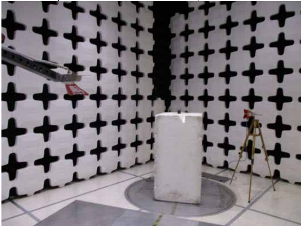
Test Setup for Radiated Emissions – Above 1GHz, Vertical Polarization