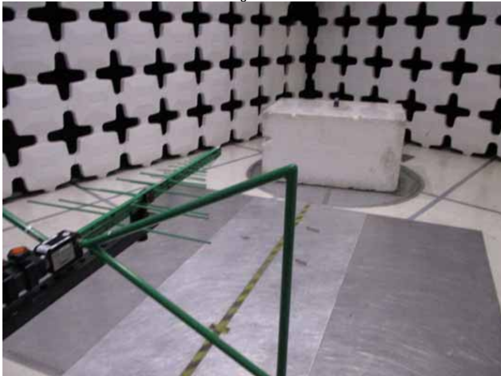
Test Setup for Radiated Emissions – 30MHz to 1000MHz, Horizontal Polarization