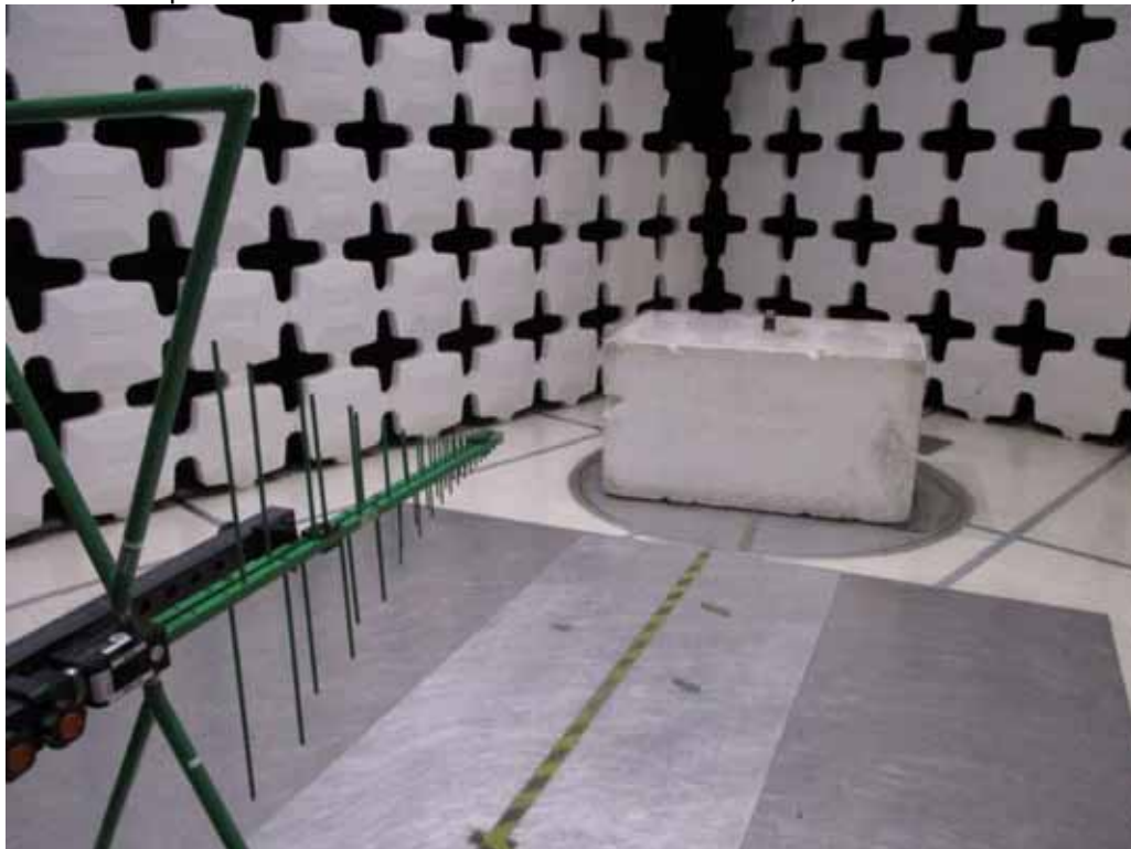
Test Setup for Radiated Emissions – 30MHz to 1000MHz, Vertical Polarization