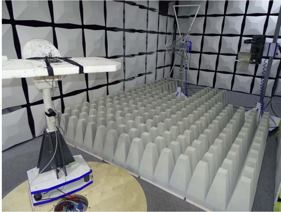
Photo 1: Test setup for radiated measurements (Enclosure, fully-anechoic chamber, 1-18 GHz intentional radiator §15 / 30 MHz – 10/20 GHz §22/24/27)