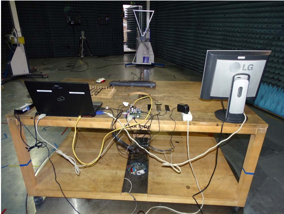
Photo 3: Test setup for radiated measurements (computer peripheral setup, EUT supplied by USB-cable from computer, unintentional radiator §15.109, ANSI C63.4) Below 1 GHz