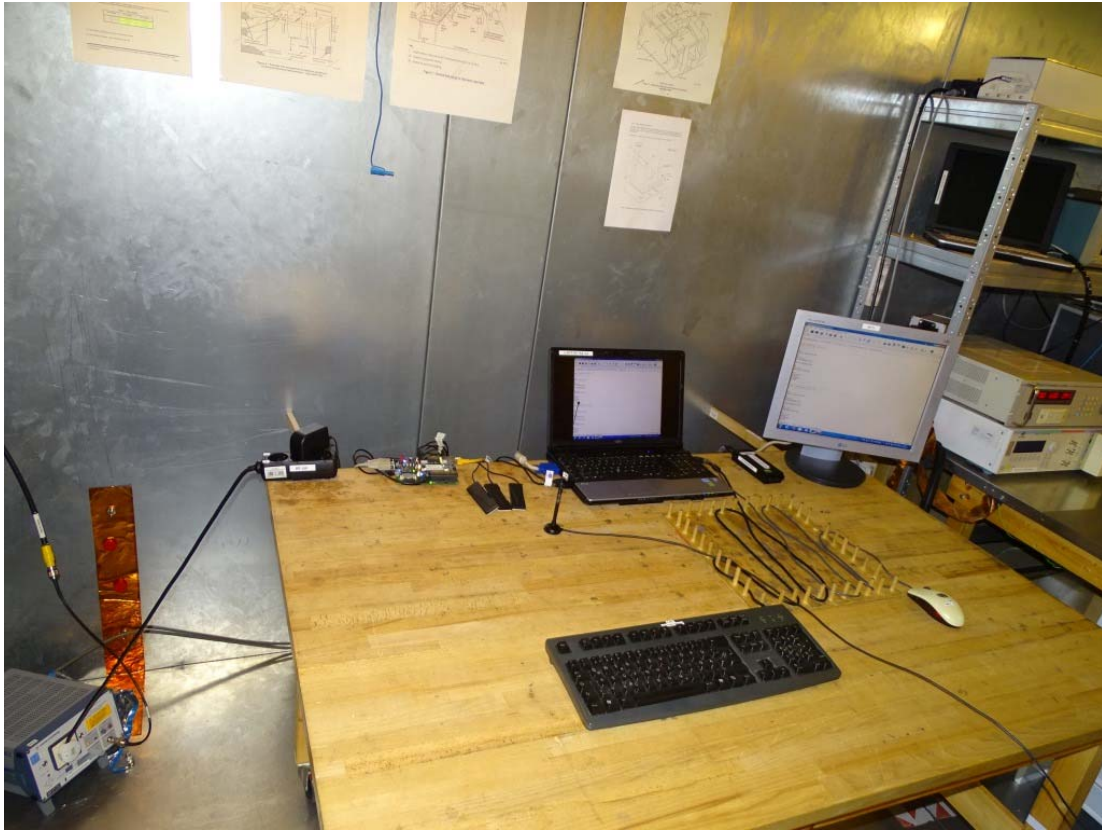
Photo 2: Test setup for conducted measurements (computer peripheral setup, EUT supplied by USB-cable from computer, unintentional radiator §15.107, ANSI C63.4)