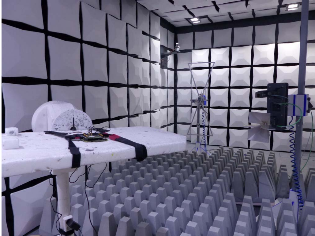
Photo 1: Test setup for radiated measurements (Enclosure, fully-anechoic chamber, 1-18 GHz intentional radiator §15 / 30 MHz – 10/20 GHz §22/24/27)