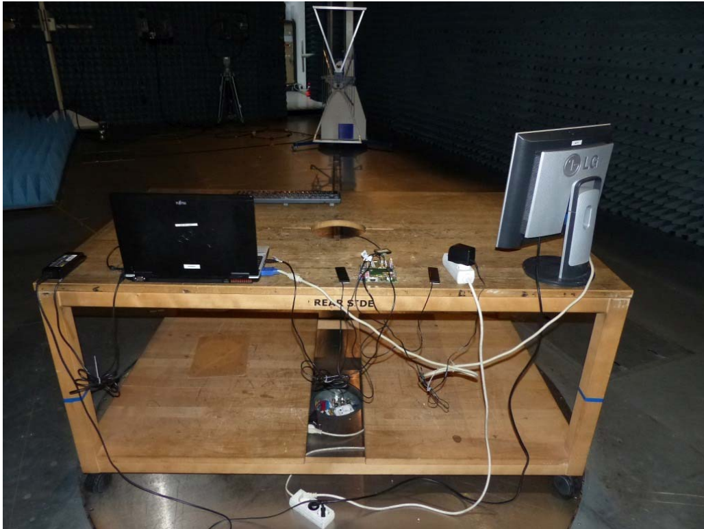
Photo 4: Test setup for radiated measurements (computer peripheral setup, EUT supplied by USB-cable from computer, unintentional radiator $15.109, ANSI C63.4) Below 1 GHz