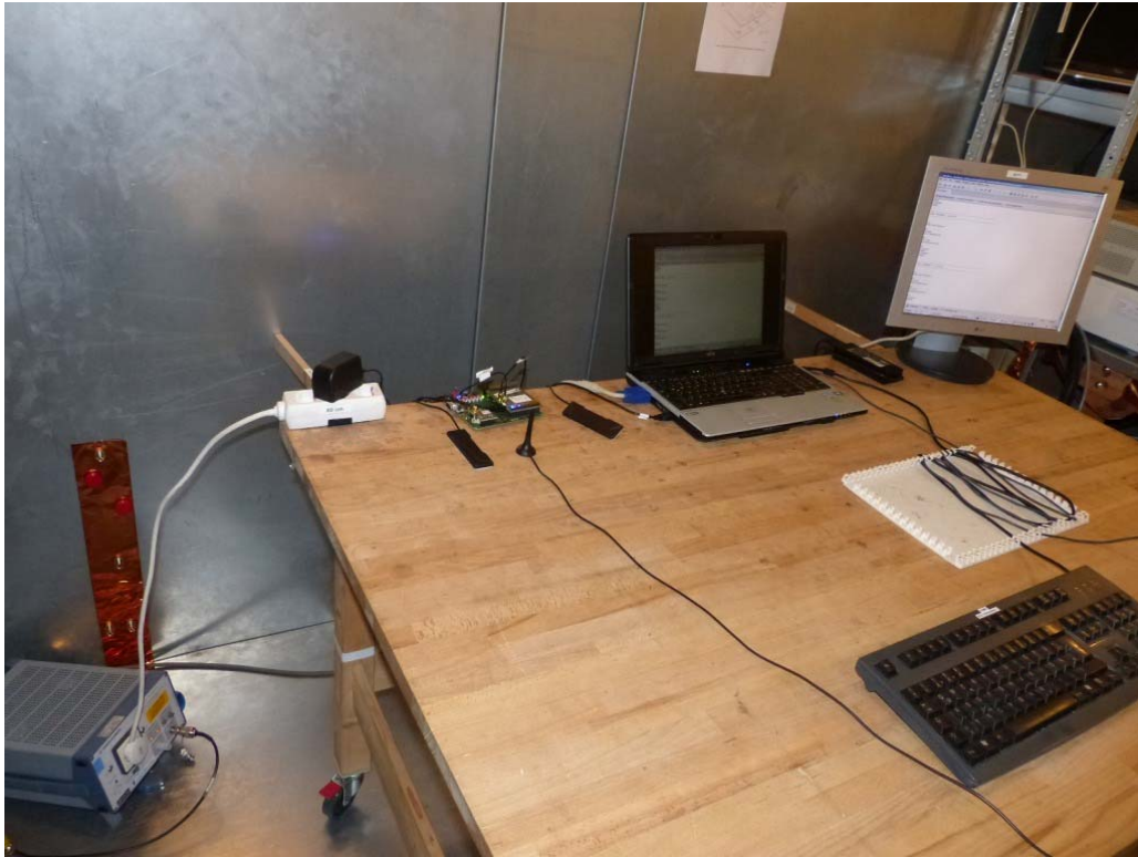
Photo 3: Test setup for conducted measurements (computer peripheral setup, EUT supplied by USB-cable from computer, unintentional radiator S15.107, ANSI C63.4)