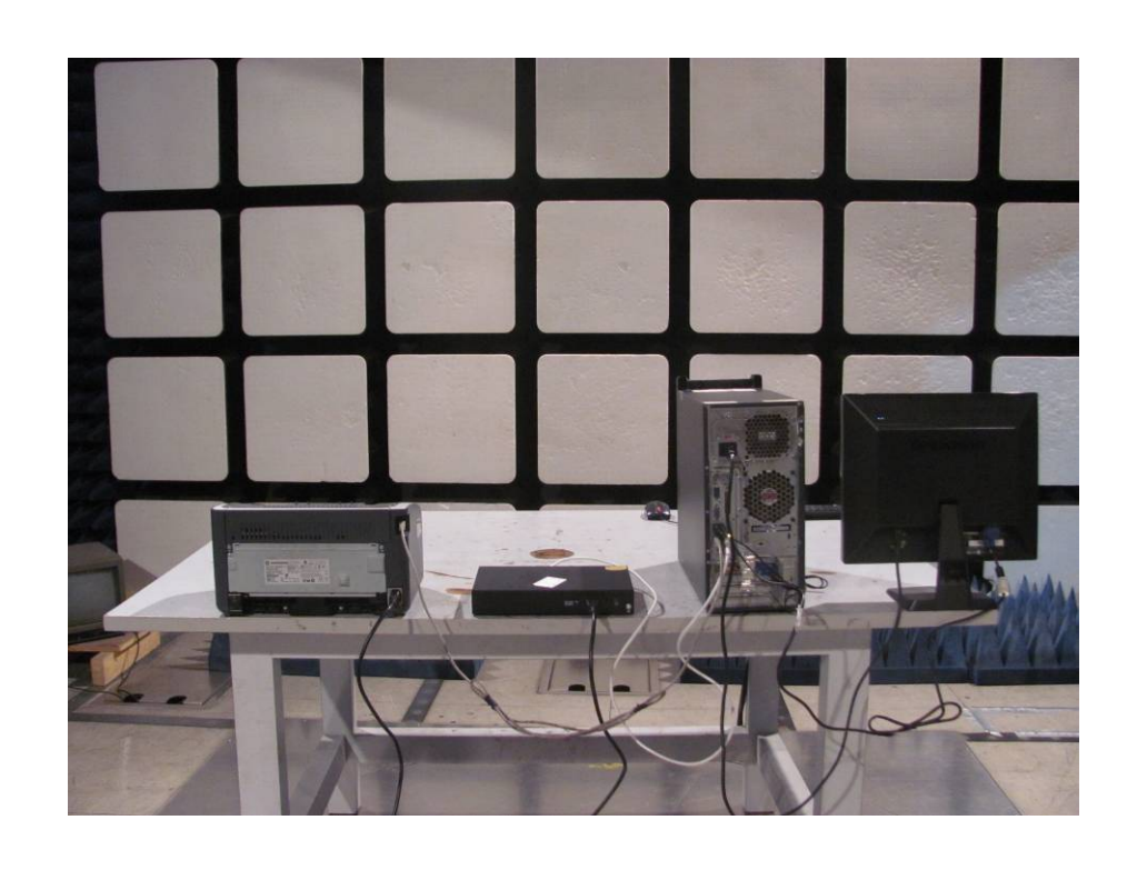
CONDUCTED EMISSION TEST