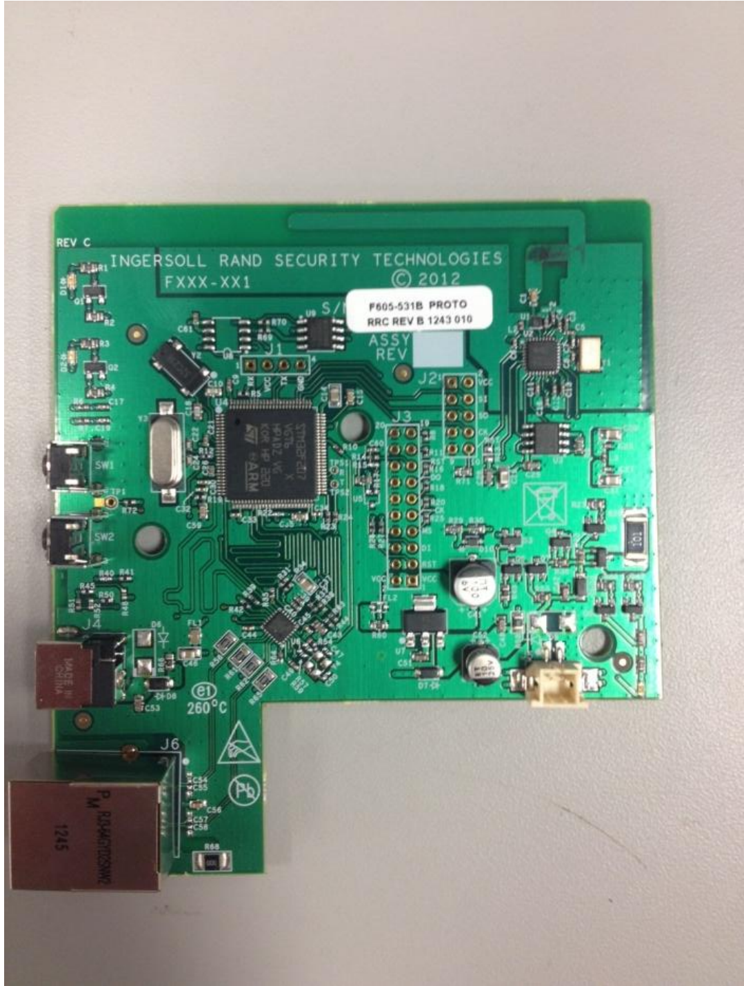
Images 2: The PCB is completely removed from clamshell. This is the front.