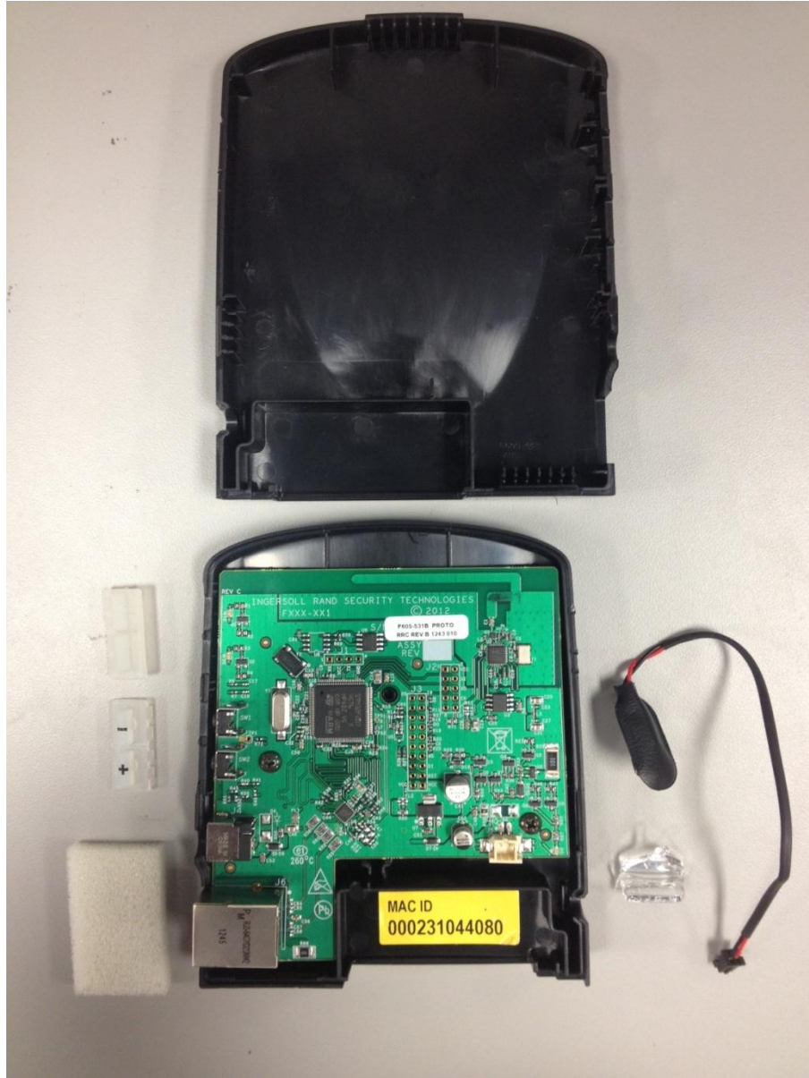
Image 1: Gen2 Bridge (Equipment Under Test) as it appears upon opening of plastic Clamshell. Image includes two halves of outer shell, PCB mounted to one shell half by two mounting screws, battery foam, Plastic light Tube, battery connector, silicone LED covers, silicone positive and negative button covers.