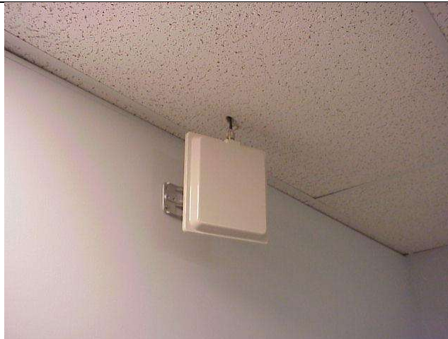
2. MA-CL67-15 and MA-CL92-5 (Typical antenna installation)