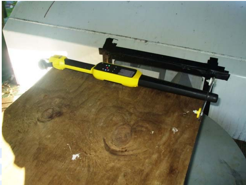
Device in the X plane