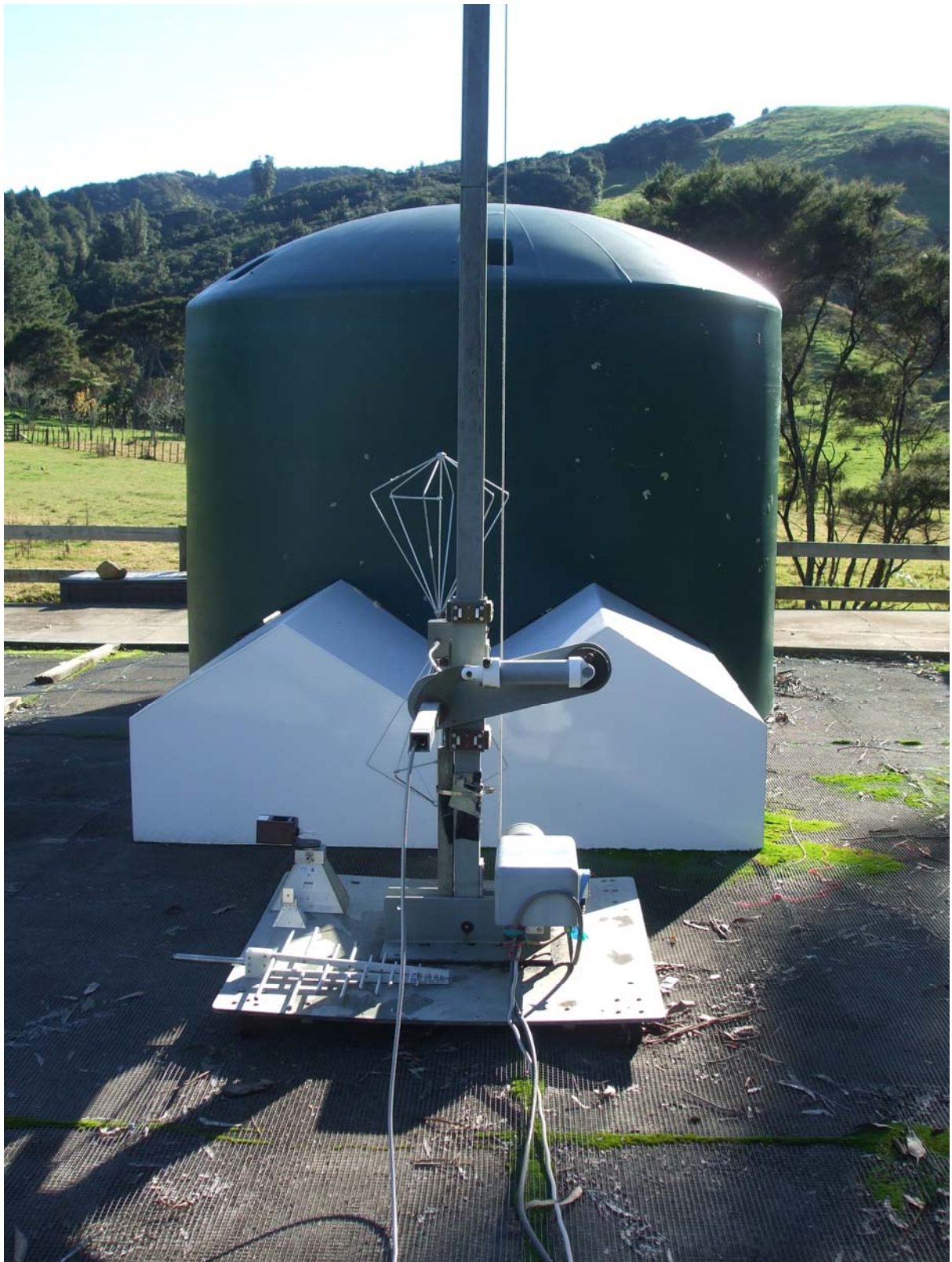
Schwarzbeck Biconnical Antenna (30 - 300 MHz)