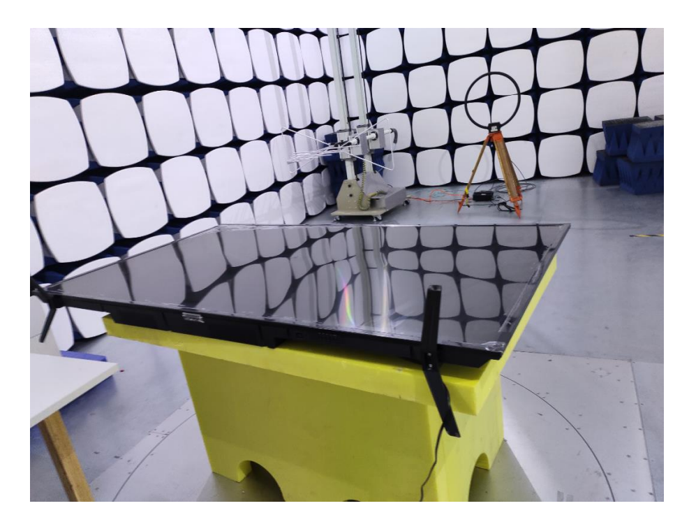
Radiated emission 30MHz~1GHz