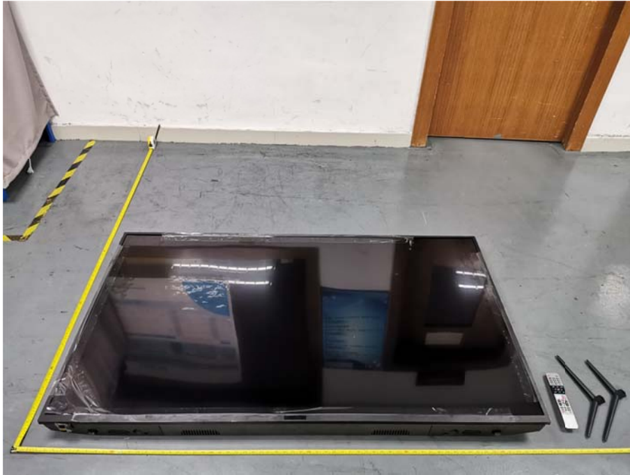
EUT View 2