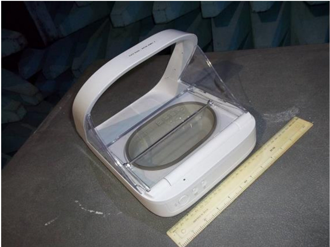
Figure 1 – General View

Pet feeder which allows the conditional access to food based on the animal RFID tags. It is intended for use in a domestic environment. Usually situated on the floor in a kitchen.