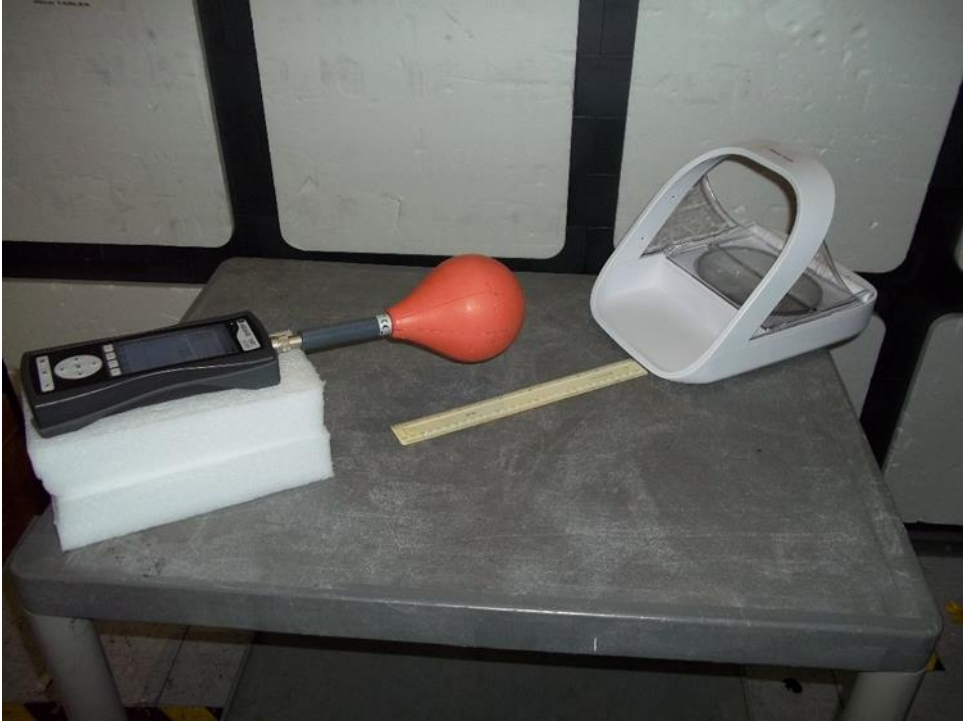
Figure 4 – Front Face Test Set-Up