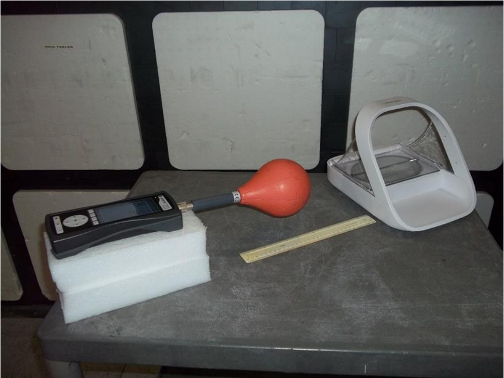
Figure 6 – Left Hand Side Face Test Set-Up