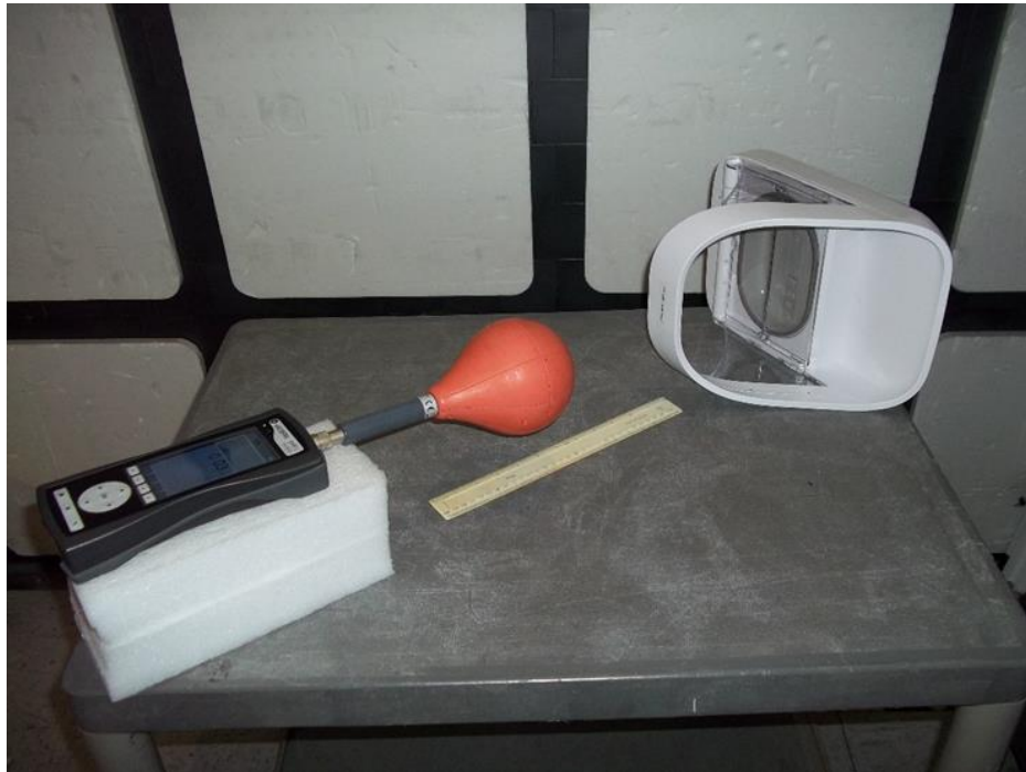
Figure 8 – Top Face Test Set-Up