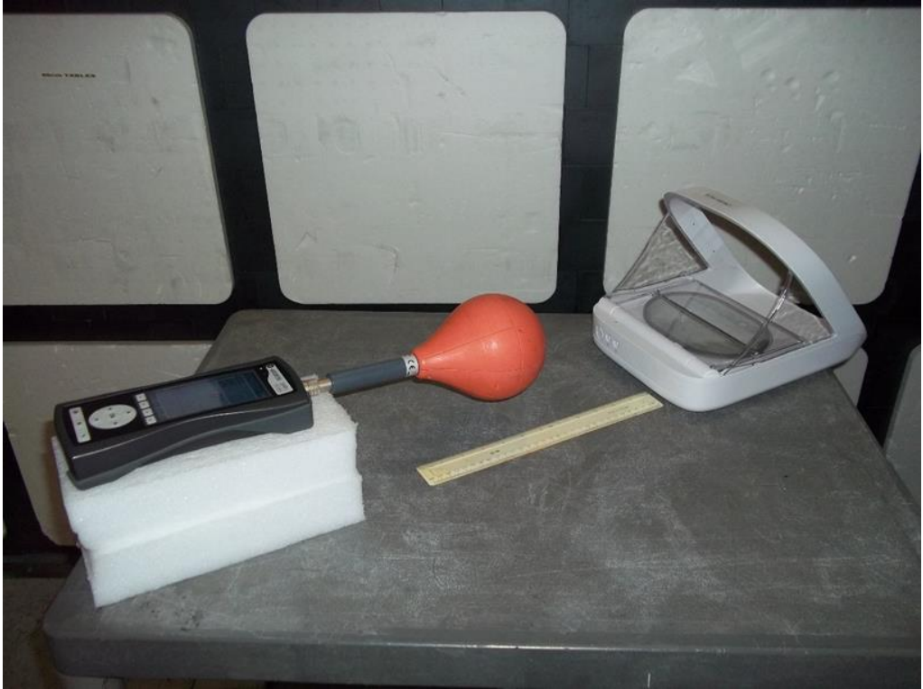
Figure 7 – Back Face Test Set-Up