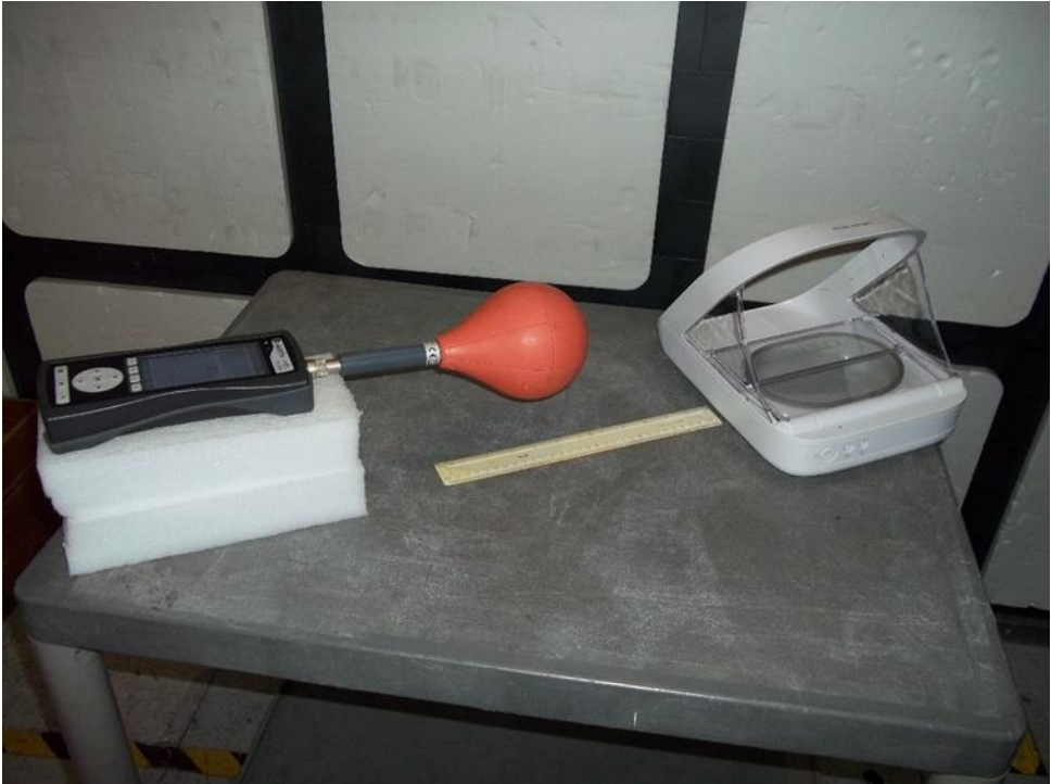
Figure 5 – Right Hand Side Face Test Set-Up