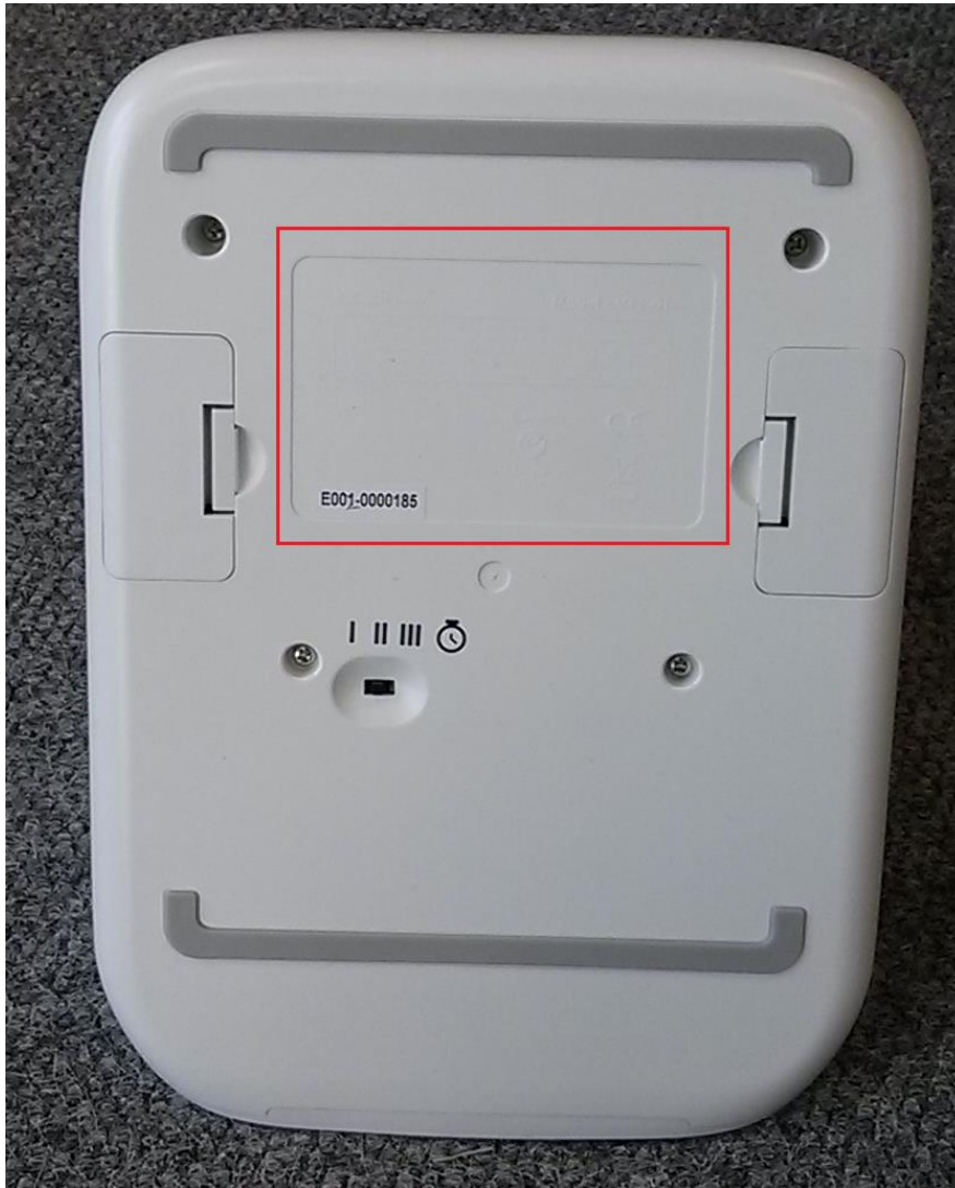
Figure 1: The compliance label is moulded onto the base of the product in the red box area.