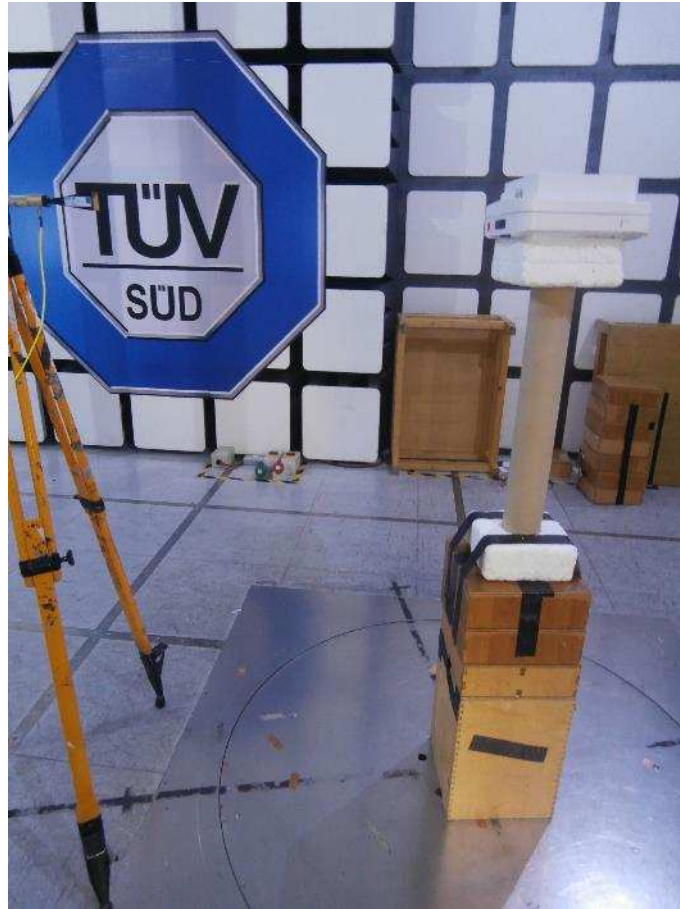
Radiated Emissions 18 GHz to 25 GHz

SureFlap Ltd Automatic Pet Door. Model: IMPD** (** represent the colour variation of the product.)