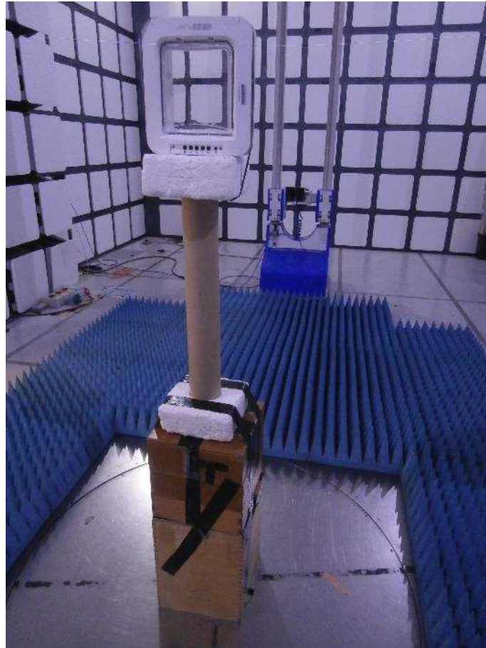
Radiated Emissions 1 GHz to 8 GHz

SureFlap Ltd Automatic Pet Door. Model: iMPD** (** represent the colour variation of the product.)