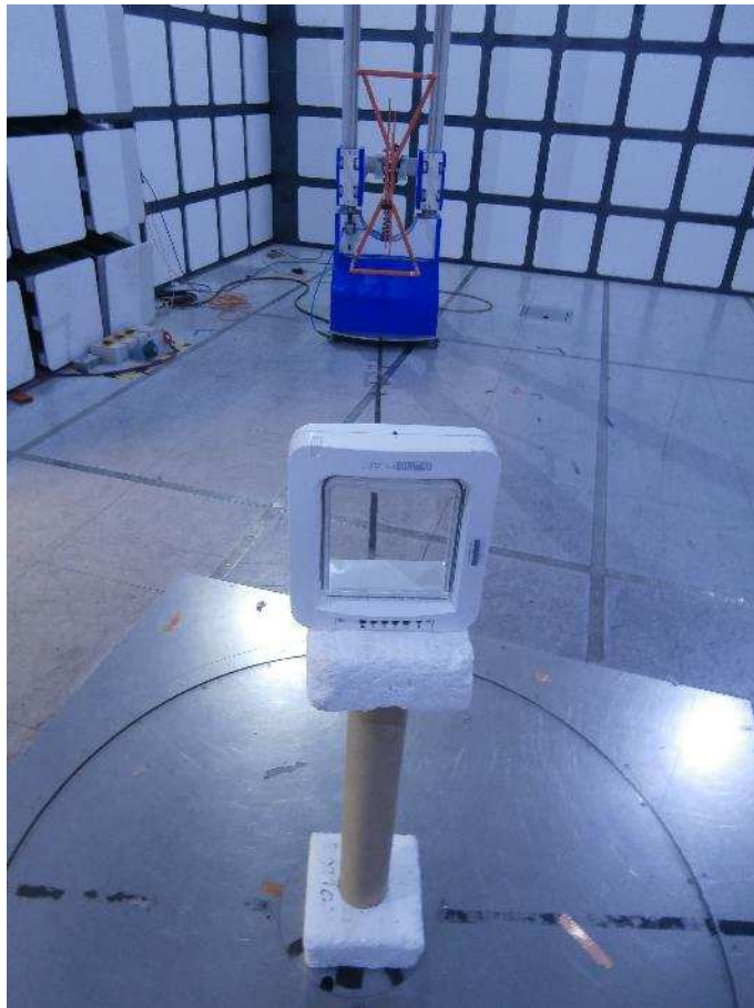
Radiated Emissions 30 MHz to 1 GHz

SureFlap Ltd Automatic Pet Door. Model: iMPD** (** represent the colour variation of the product.)