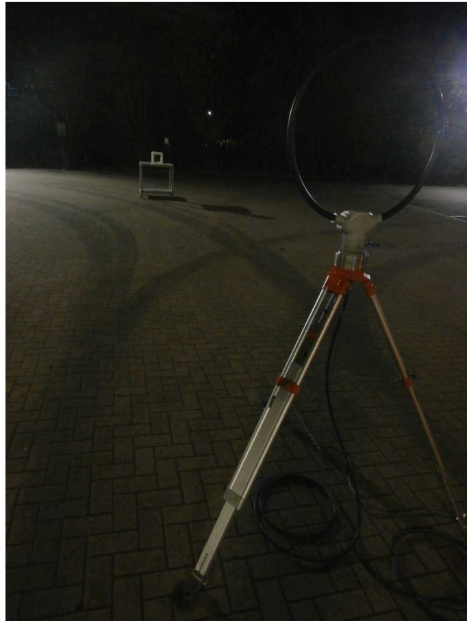
Radiated Emissions < 30 MHz (Outside)