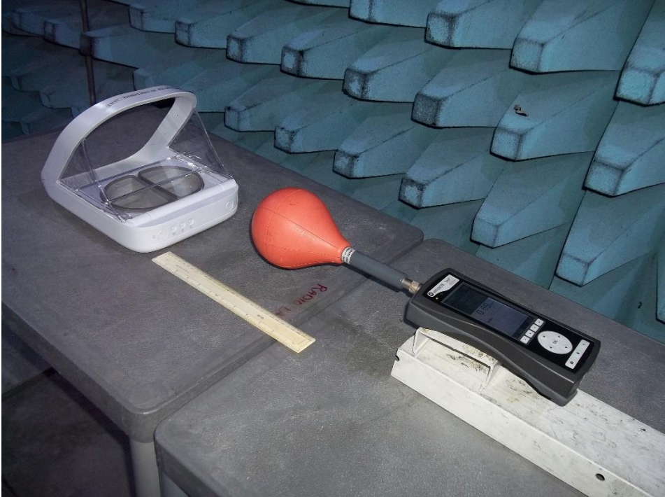
Figure 7 – Back Face Test Set-Up