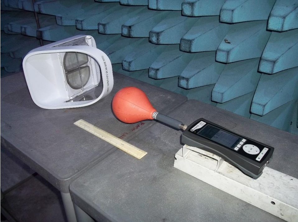
Figure 8 - Top Face Test Set-Up