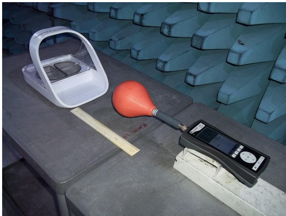
Figure 4 - Front Face Test Set-Up