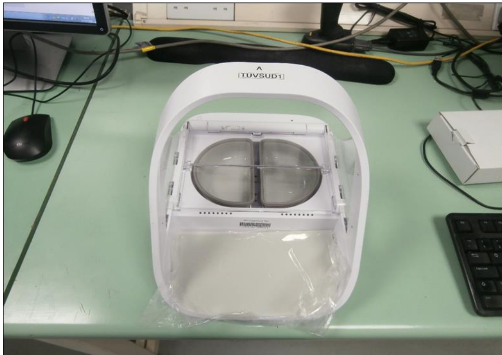
Figure 1 – General View

This report addresses only the RFID frequencies.