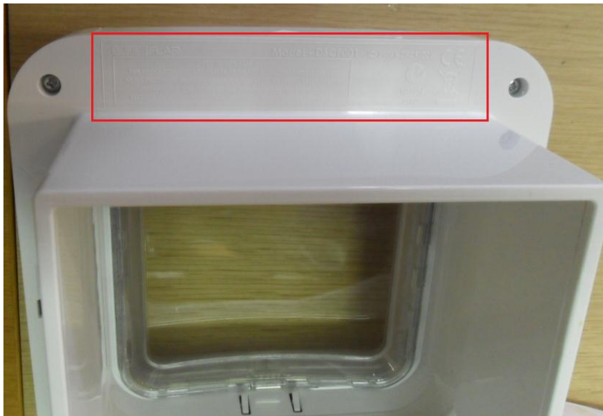
Figure 1: The compliance label is moulded onto the plastic in the red box area.