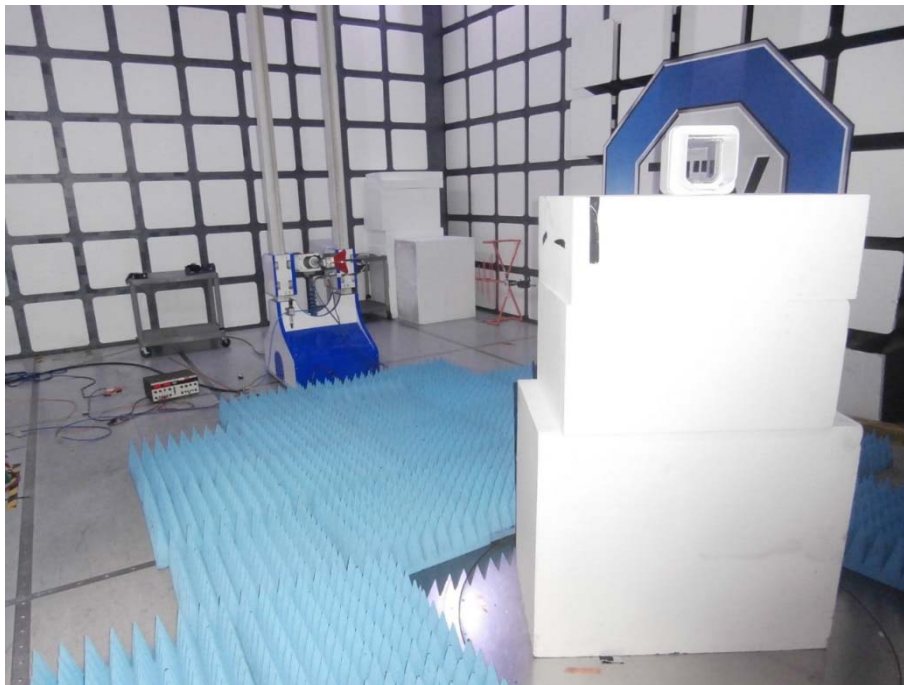
Radiated Emissions 1 GHz to 25 GHz