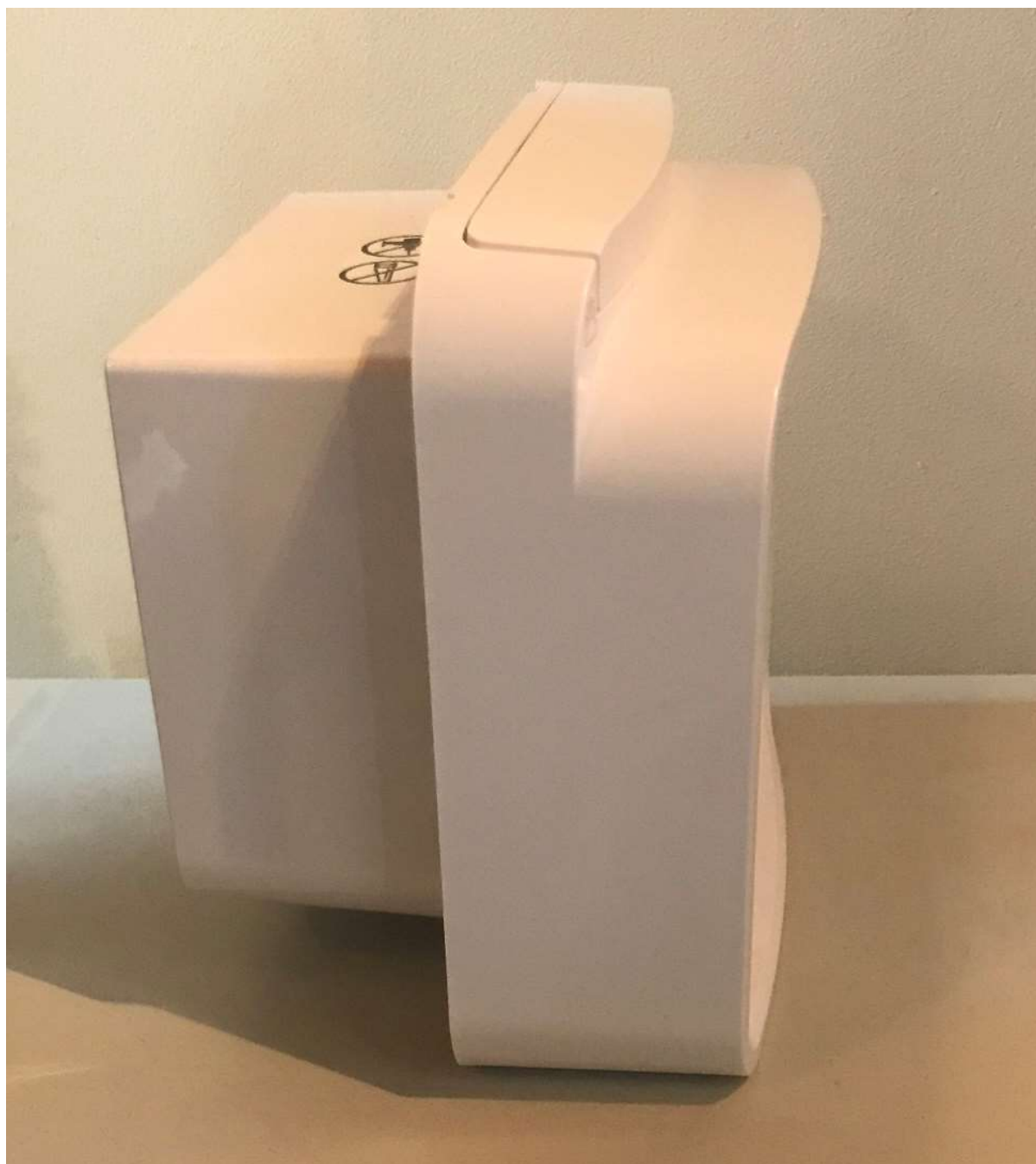
Lefthand side view

Tel: +44 (0)1954 211 664 surepetcare.com