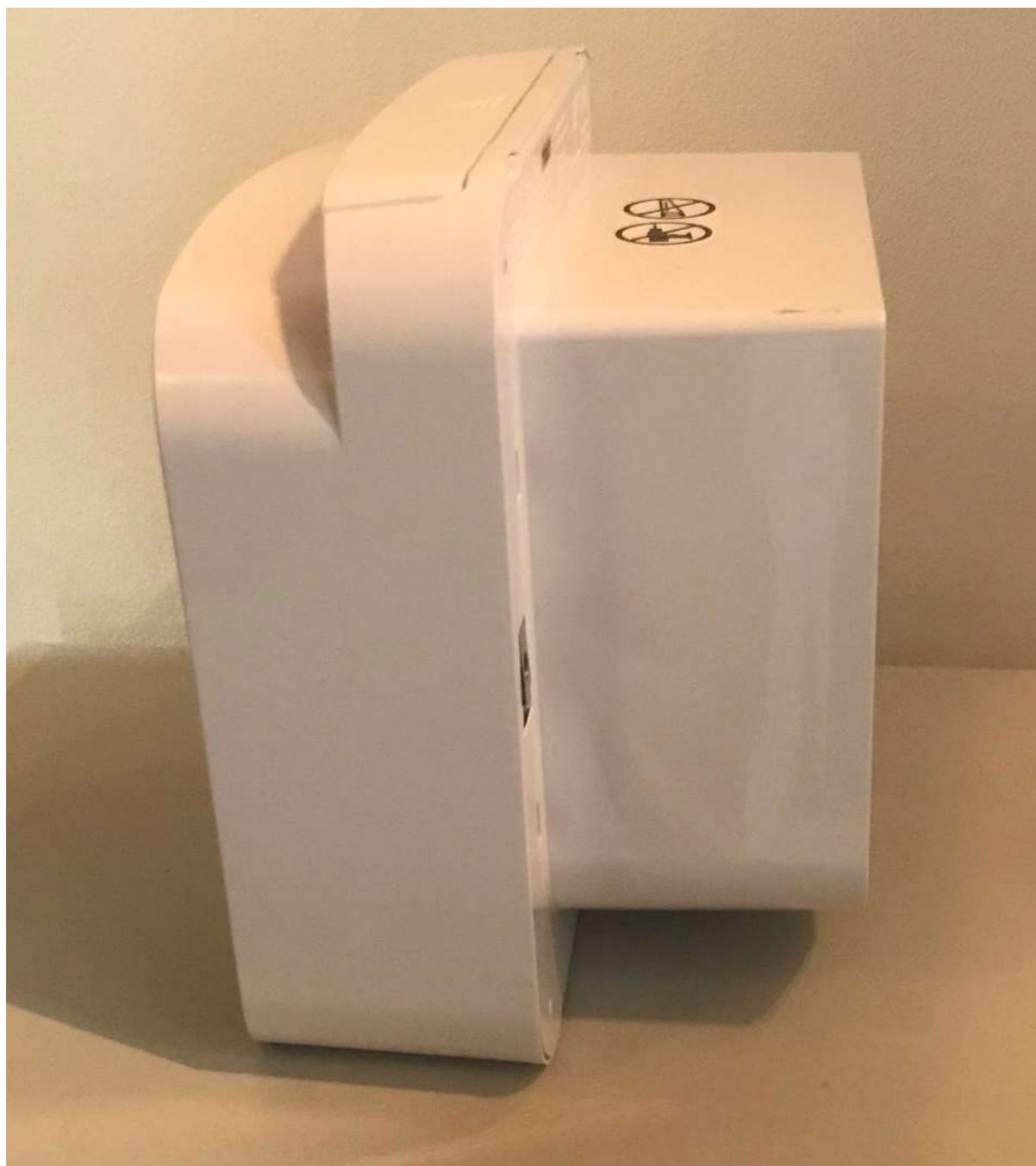
Righthand side view

Tel: +44 (0)1954 211 664 surepetcare.com