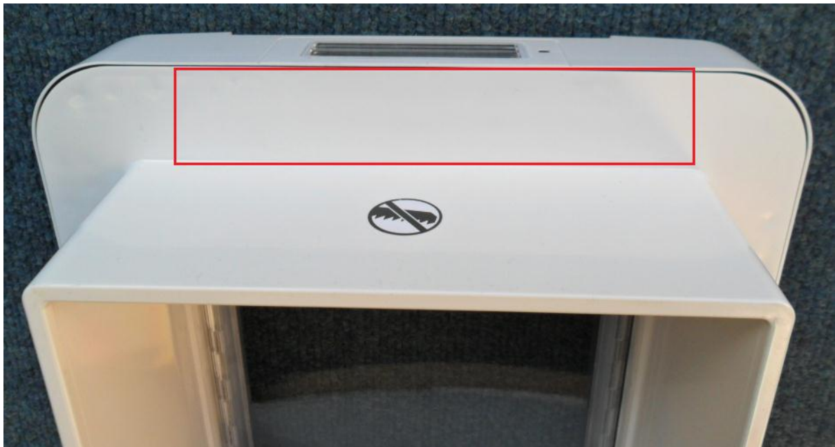
Figure 1: The compliance label will be moulded onto the plastic in the red box area.