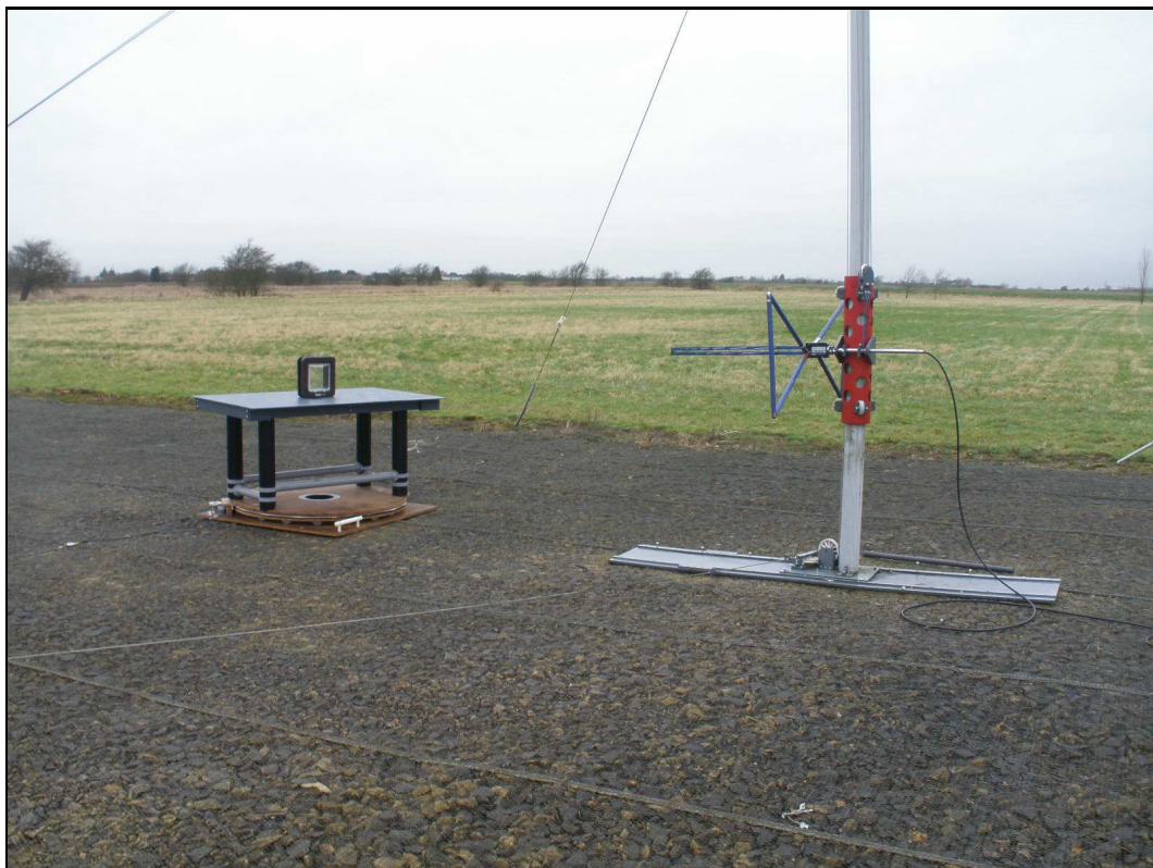
Photograph 2 Radiated Emissions - above 30MHz

This report shall not be reproduced except in full, without the written approval of: dB Technology (Cambridge) Ltd.