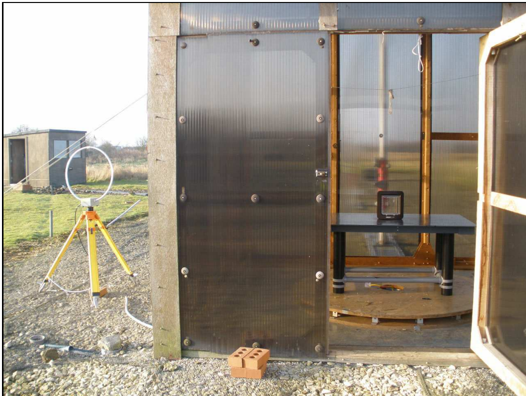
Photograph 1 Radiated Emissions - below 30MHz