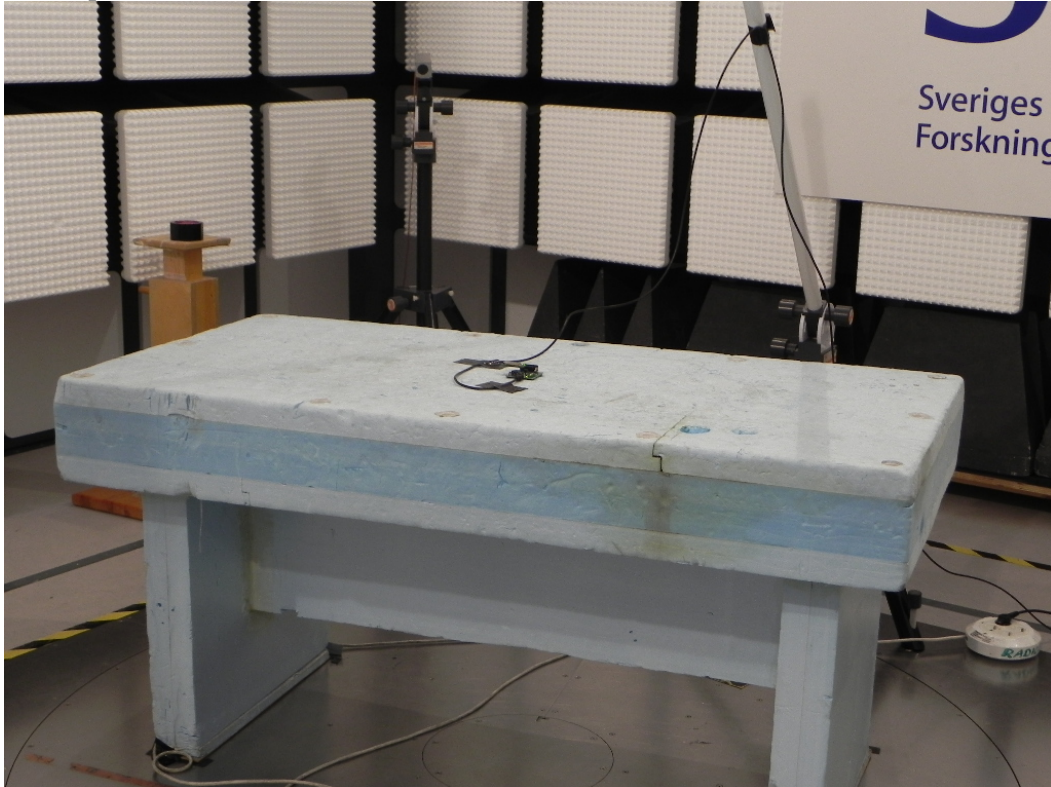
Close up, EUT and cables