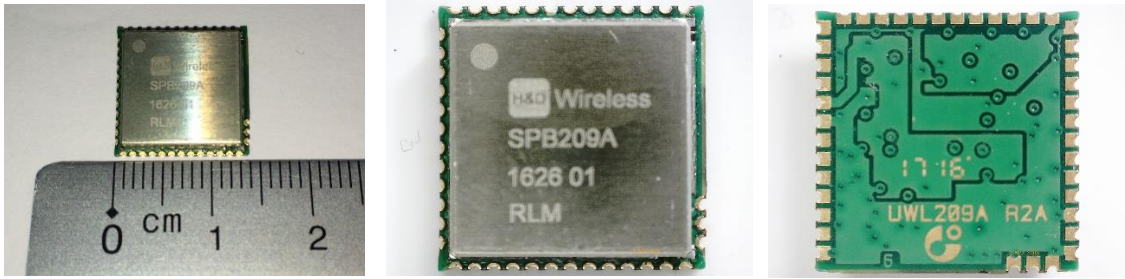
Figure 1, SPB209A RF module top and bottom