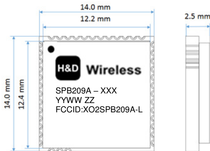
Figure 6.1: Mechanical drawing, equivalent to a 41 pin Quad Flat No-Lead (QFN) package.